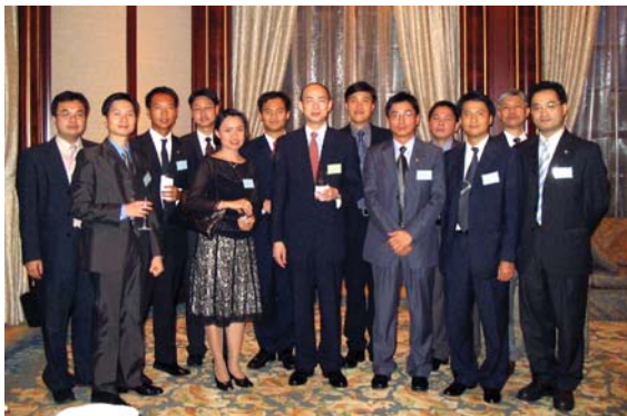
Acting Commissioner Lawrence Wong with some of the participants of the Department.

T he US Drug Enforcement Administration (DEA), Hong Kong Country Office organised the Precursor Chemical Control Training Seminar in Hong Kong from August 25 to 29, 2003.