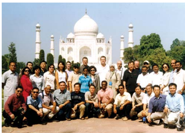
WCO RCP Meeting delegates visiting the famous Taj Mahal.

Security and Facilitation, Capacity Building and Regional Arrangements were the three main themes of the 13th RCP Meeting. In our capacity as the Activity Co-ordinator, Hong Kong Customs submitted progress reports on the two Regional Strategic Plan key activities concerning the implementation of regional enforcement programmes and promotion of Customs-Business partnership. We also reported on a regional survey conducted by us regarding the way forward for action plan arising from the 2002 Regional Enforcement Seminar in Chengdu and obtained endorsement of the Meeting on our two proposals.