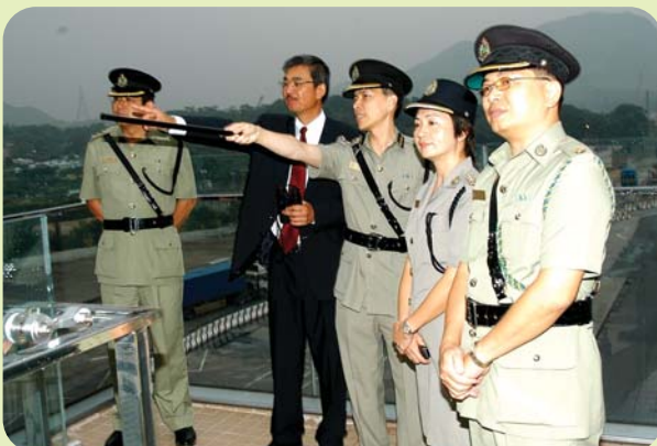
The Commissioner has a bird's eye view of the cross-boundary facilities at the Lok Ma Chau Control Point observation post.