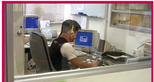
Duty Inspector listening to calls received through the hotline for quality assurance.

In October, Ports and Maritime Command (PMC) officers made a record seizure of two tonnes of ivory, and this was the