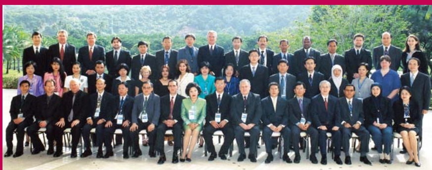
Group photo of the Second 2003 APEC SCCP Meeting.