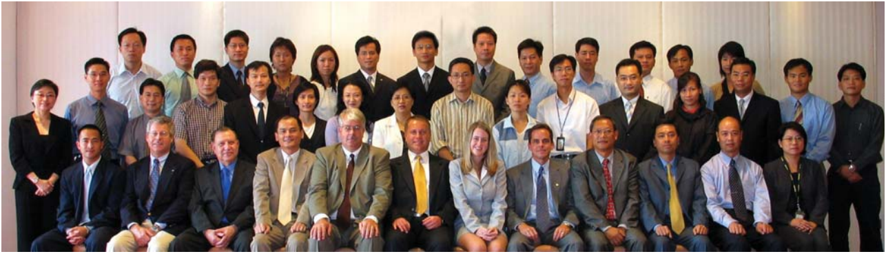
The instructors of the Cargo Profiling Techniques and Tracking Seminar with the participants.

T he Ports and Maritime Command and the US Navy jointly organised the Cargo Profiling Techniques and Tracking Seminar on July 31, 2003. Thirty-six officers from various major Formations and the US Container Security Initiative Team had participated in the course. The seminar aimed at enhancing participants' techniques in profiling high risk container shipments for strengthening maritime security.