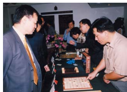
Members of Chess and Board Games Interest Group enjoying the close matches.