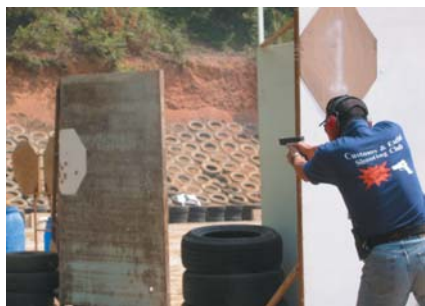
A member of the Customs Shooting Club aiming at the target.