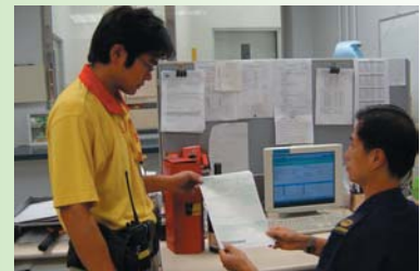
Along with the goods concerned, the duty assessor handed over the General Demand Note to the air cargo operator.

As the transaction does not involve any cash or cheque, it saves cost and time in handling those monetary items. Most importantly, absolute security can be guaranteed. In fact, the new payment method does not only provide greater flexibility to the participants, but save Customs' manpower and cost. In light of its merits, it is planned to extend the scheme to other air cargo terminals and continue to introduce the scheme to other interested cargo handlers.