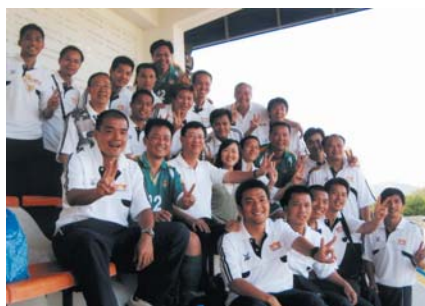
Football Team after the 10th Regional Customs Football Tournament.

For sports and recreation, the Department is running 15 interest groups. Their activities are for fun and they help colleagues to maintain a healthy lifestyle. I have talked to five colleagues who each led one of the most popular interest groups.