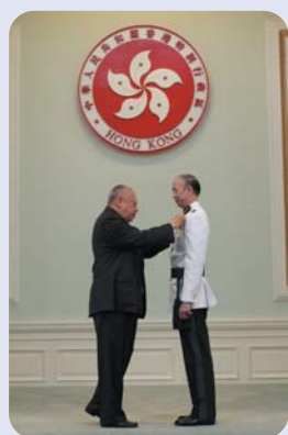
黃秀培 Lawrence Wong