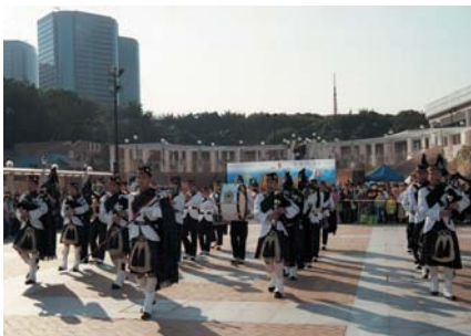
Customs Band playing at the opening ceremony of the "Hong Kong- the Real Experience" Carnival at the Kowloon Park.