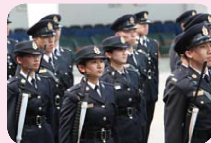
The new female uniform hat comes under spotlight at the passing-out parade on April 1, 2010.

Having accomplished its historic mission since 1981, the obsolete hat was kept in the Customs Museum as part of the Department's heritage.