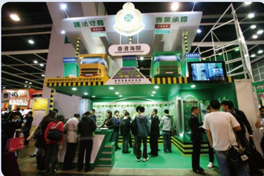
The Customs booth set up at the Careers Expo introduces the work and recruitment information to the public.

Hong Kong Customs participated in the Education and Careers Expo 2010 from February 4 to 7, 2010. A booth on Customs' work and recruitment information was set up by the Office of Training and Development, the Office of Service Administration and the Trade Controls Branch at the Expo. Officers of the Customs Detector Dog Division also stationed at the booth to explain their job duty to visitors. The Expo, organised by the Hong Kong Trade Development Council, was well received with over 100,000 visitors.