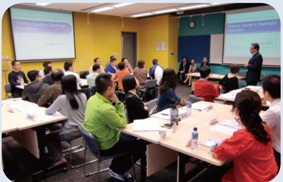
A total of 30 Customs officers attend the “Seafreight Operations” course.

the officers on various aspects including the contemporary practices in the logistics industry so that the officers could apply the knowledge in their daily duties such as cargo clearance, case investigation, intelligence analysis as well as training and development.