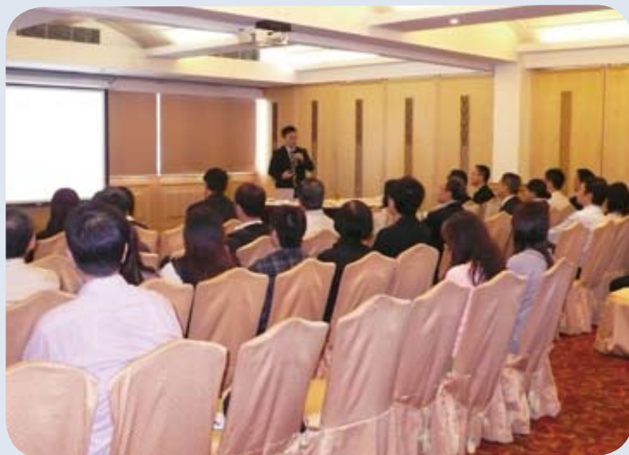
More than 30 participants from the industries attend the workshop.

Workshop for the business partners of dutiable commodities and motor vehicles industries on March 2, 2010. This workshop was also aimed at echoing the Revised Arusha Declaration (2003) adopted by the World Customs Organization (WCO) for promoting integrity at the international level. More than 30 managers from the industries attended the workshop to learn how to develop in-house measures to strengthen integrity in their organisations.