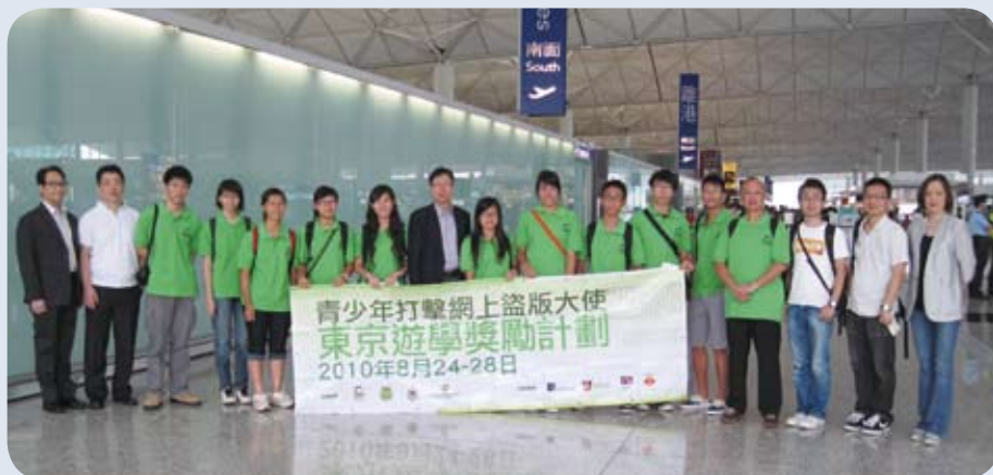
Ten winners of the competition depart Hong Kong on August 24 for a five-day visit to Tokyo, Japan to enrich their knowledge of the protection of IPRs.

To promote the respect for intellectual property rights (IPR) on the Internet and cultivate positive values among youngsters, the Customs and Excise Department (C&ED) and the Intellectual Property Rights Protection Alliance (IPRPA), supported by Intellectual Property Department (IPD), jointly organised the Protection of Intellectual Property Rights on the Internet Creative Competition from May 4 to June 14, 2010.