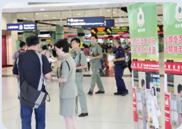
Customs officers distribute leaflets to remind travellers of the new measure.

With effect from August 1, 2010, the quantity of tobacco products allowed to bring into Hong Kong has changed. Under the new measure, an incoming passenger aged 18 or above could only bring into Hong Kong for his own use no more than 19 cigarettes; or 1 cigar or 25 grams of cigars; or 25 grams of other manufactured