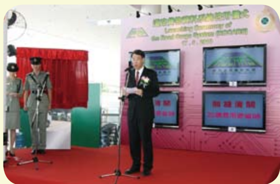
The Commissioner of Customs and Excise, Mr Richard Yuen, speaks at the launching ceremony of the Road Cargo System (ROCARS).

The Hong Kong Customs launched the Road Cargo System (ROCARS), an electronic system designed to facilitate customs clearance of road cargoes, on May 17, 2010 and started an 18-month transitional period before its mandatory implementation.