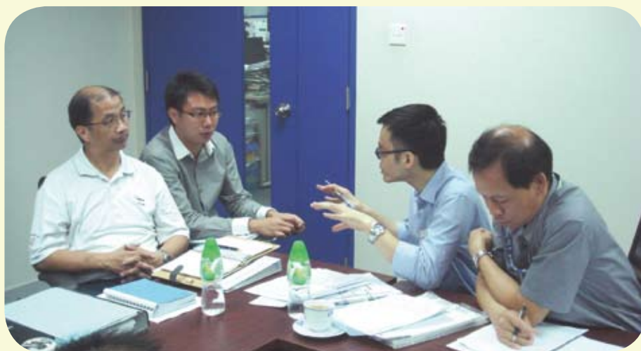
Customs officers of the AEO Team (first and second right) have a mock interview with the staff of the import and export company (first and second left) during the on-site visit.