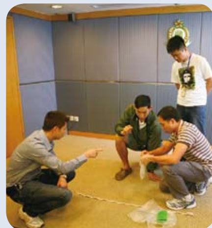
Officers receive training to enhance their photo-taking skills.

A total of 20 officers from the Rail and Ferry Command attended the course, which they found beneficial to their case work. Taking into consideration the overwhelming response from the officers, OSA is planning to extend the course to more colleagues in the future.