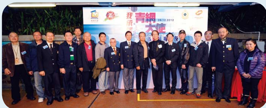
"I Pledge • Youth Ambassador Ocean Night" at Ocean Park.

In addition, a three-day visit to Zhaoqing from March 28 to 30 was held for the Youth Ambassadors to enhance their understanding of the protection of IPR in the Mainland. During the visit, the Youth Ambassadors met with officials from IPR-related government agencies as well as teachers and students of a local secondary school to gain an in-depth understanding of IPR protection in the Mainland.