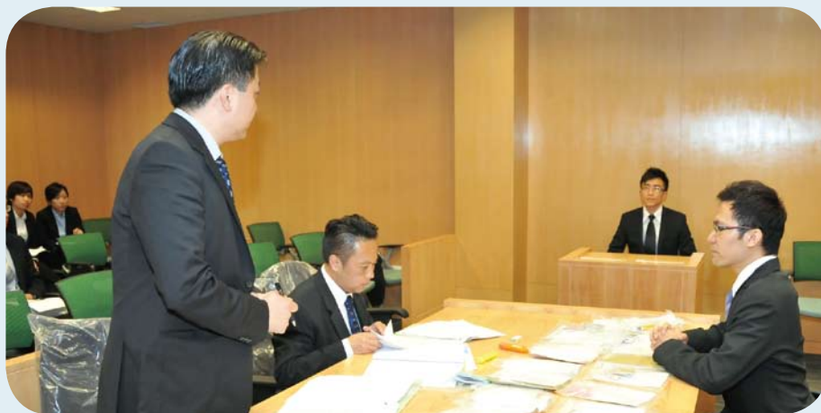
Officers in a mock trial training of Intelligence and Investigation Course.

Up to April 2013, 115 Inspectors and 777 Customs Officers have attended the courses for enhancement of their competencies and confidence at work. This in turn contributes to the provision of a more effective and efficient Customs service.