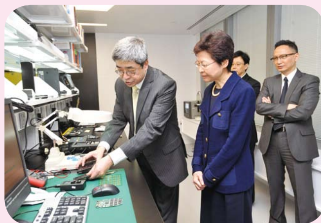
The Chief Secretary for Administration, Mrs Carrie Lam (second left) tours the Electronic Crime Investigation Centre.

During the visit, Mrs Lam also met with representatives of the staff associations of the department and chatted with the frontline staff