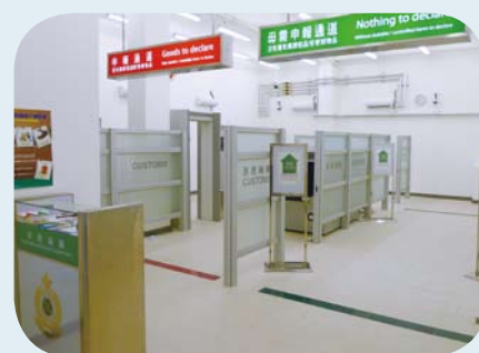
Mock Red and Green Channels.

Identification Parade Room, Video Interview Room and Simulated Shooting Range. It also installs an advanced audio and visual monitoring and recording system, so that instructors in the control room can supervise and oversee all ongoing simulation exercises, and maintain close contact with trainees for better communication.