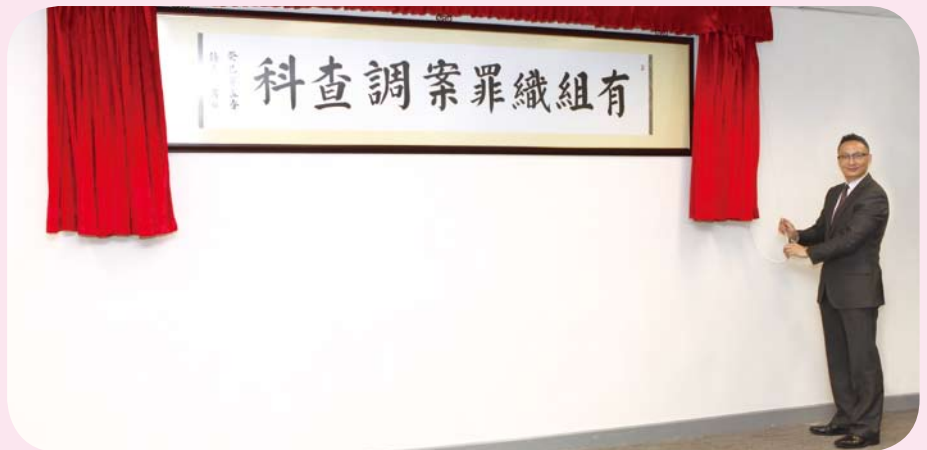
The Commissioner of Customs and Excise, Mr Clement Cheung, officiates at the opening ceremony of SCIB.

The SCIB is mainly responsible for carrying out investigation into three types of cases. They are a) indictable offences with involvement of syndicates and large sums of crime proceeds; b) joint operations with relevant authorities in the Mainland and foreign law enforcement agencies; and c) cases of complex nature where in-depth examination of commercial transactions and documentary evidence or input of expert witnesses (e.g. forensic accountant) is called for.