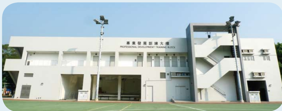
The Professional Development Training Block.

After two years' planning and construction, the Professional Development Training Block at the Customs and Excise Training School was formally opened in mid-April 2013. The building is designed to provide a venue for conducting practical and simulated exercises in the induction training for new recruits and vocational training of