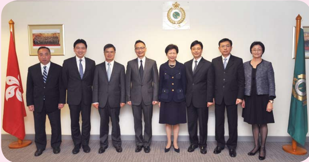
Mrs Lam (fourth right) in a group photo with the senior officials of the Customs and Excise Department during her visit to the headquarters of the department.

collecting revenue on dutiable goods and also protecting intellectual property rights and consumer interests. Mrs Lam encouraged Customs colleagues to continue providing quality services to the public.