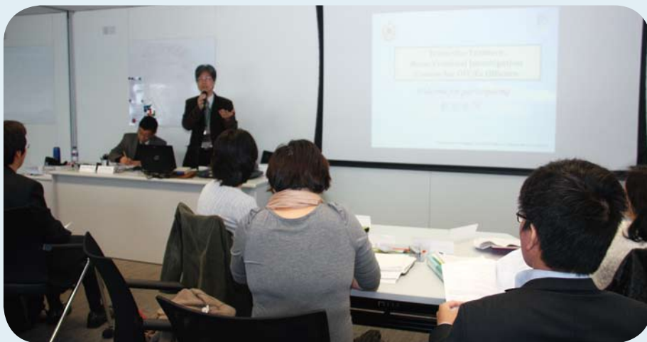
A three-day Train-the-Trainer Basic Criminal Investigation Course.

duties. It also fosters a good working relationship between the two departments in the protection of consumer rights under the Amendment Ordinance.