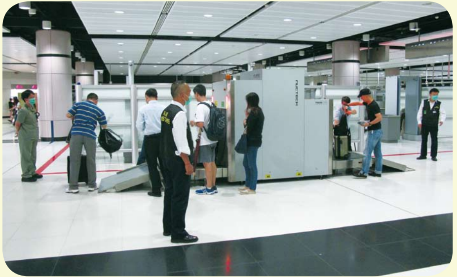
X-ray machines have been deployed at control points to speed up baggage inspections.

The Customs & Excise Department was tasked to implement the new control regime on various fronts, including enforcement and publicity. To enforce the regulation, outbound inspections of cargoes, vehicles and passengers are stepped up at all boundary control points. Intelligence and investigative efforts are enhanced to combat smuggling of powdered formula into the Mainland by crime syndicates. The new measure is also publicised at boundary control points and via stakeholders of the travel industry