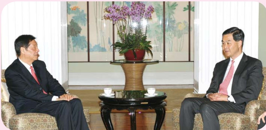
The Chief Executive, Mr C Y Leung (right), meets the visiting Minister of the General Administration of Customs, Mr Yu Guangzhou (left), at Government House to exchange views on issues of mutual concern.

This is the 13th annual meeting between the Hong Kong and China Customs since the signing of the Customs Co-operative Arrangement in 2000. The meeting reviewed the co-operation between the two Customs administrations on trade facilitation, anti-smuggling, anti-narcotics, intellectual property rights protection and staff training last year. The two Customs bodies also recognised the remarkable achievements resulting from close