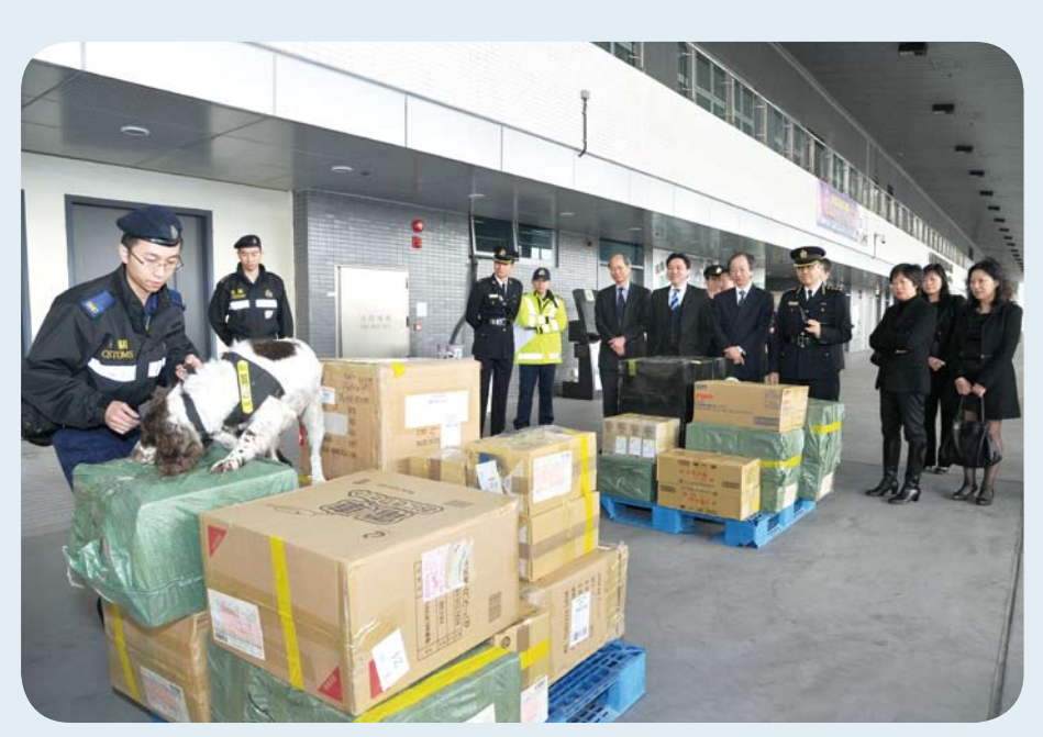
A drug search demonstration by the Customs detector dog.