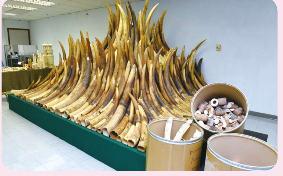
A total of one tonne of seized ivory was destroyed by way of incineration right after the Launching Ceremony on May 15, 2014.