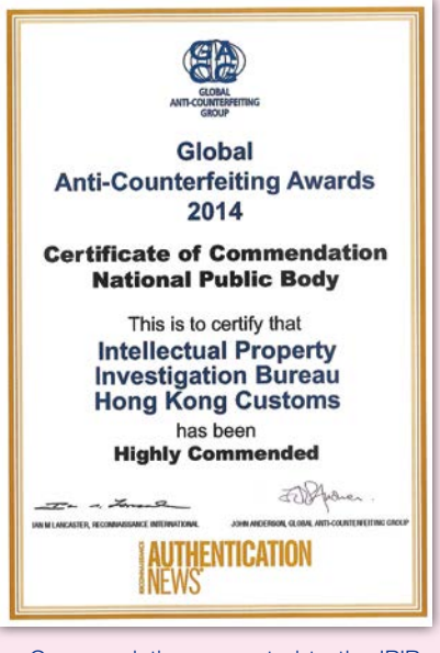
The Commendation presented to the IPIB of Hong Kong Customs.

close contact with international counterparts. Customs officials participated in two international conferences organised by the International Anti-Counterfeiting Coalition (IACC) and the World Customs Organisation (WCO) respectively in Hong Kong in May.