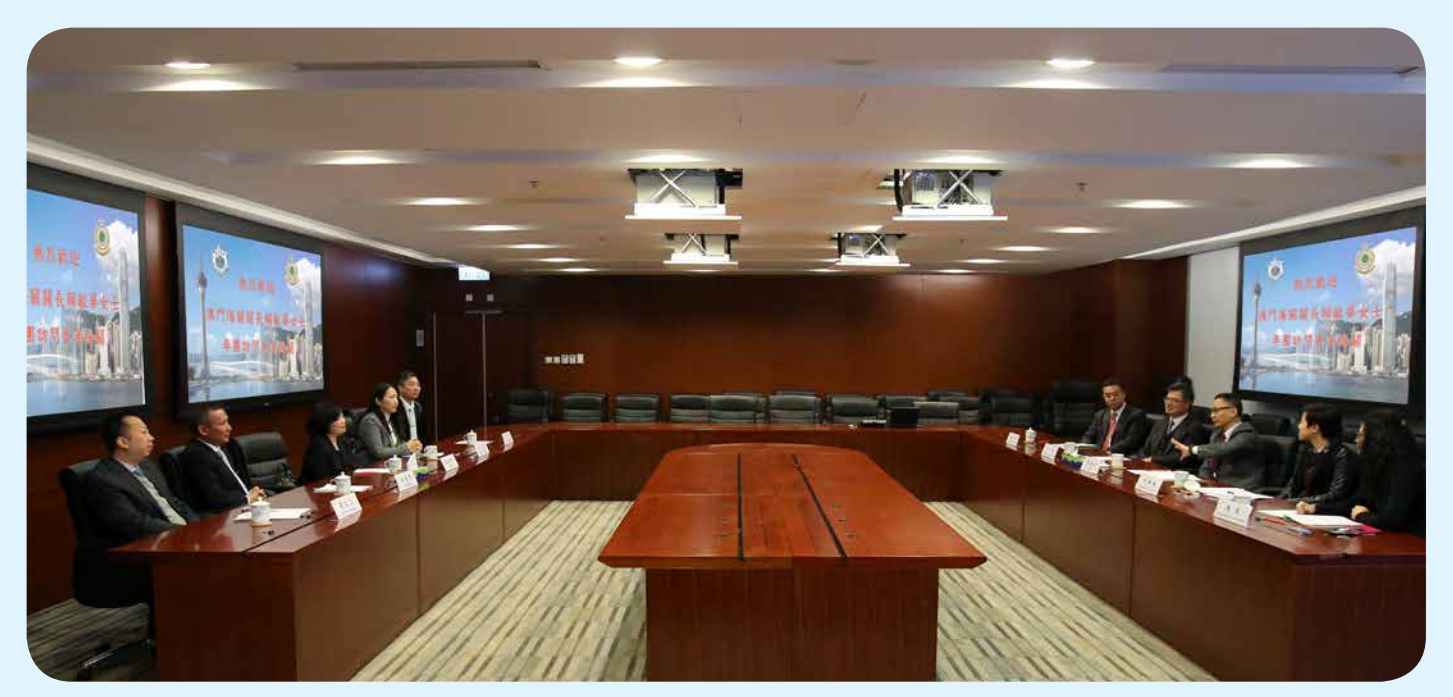
Hong Kong and Macao Customs delegations exchange views in the meeting.