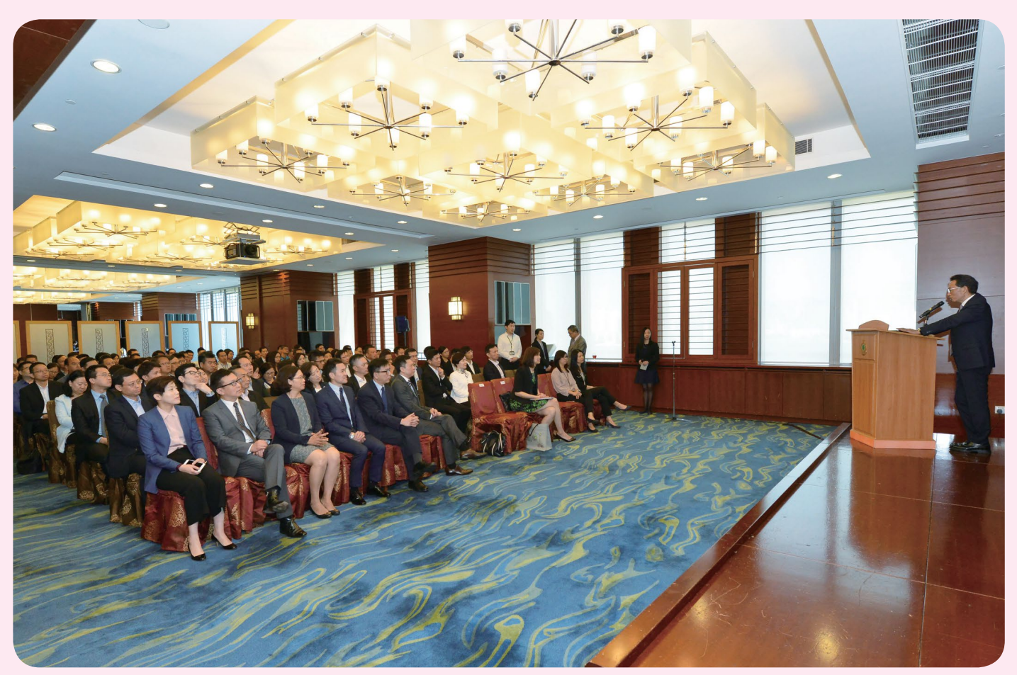
The seminar on personal data protection by Privacy Commissioner for Personal Data Mr Stephen Wong was very well-received with more than 100 officers from various formations, including directorate officials of the Department attended.

Personal data includes names, phone numbers, addresses, identity card numbers, medical records and employment records. With the implementation of the Personal Data (Privacy) Ordinance since December 1996 and the proactive promotion efforts by the Office of the Privacy Commissioner for Personal Data, members of the public have increasingly valued the protection of personal privacy.