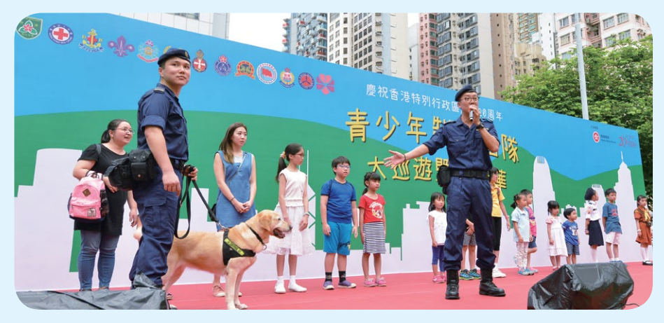
Customs Detector Dog Division gives a drug detector dog demonstration at the carnival.

the Junior Police Call, the event was a programme to celebrate the twentieth anniversary of the establishment of the Hong Kong Special Administrative Region.