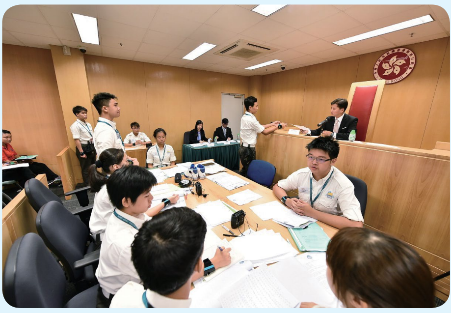
Trainees of the first "Advanced Course of the Intellectual Property Rights Badge Programme" organised under the "Youth Ambassador Against Internet Piracy Scheme" participate in a mock-up trial competition.

The Advanced Course of the IPR Badge Programme was conducted between August 21 and 25 last year, with the