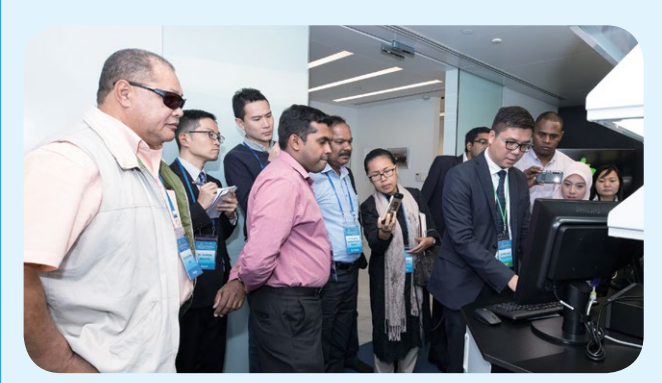
Participants of the workshop visits the Electronic Crime Investigation Center of Hong Kong Customs in order to understand the Department's work in combating cybercrime.

Hong Kong Customs, in coordination with the World Customs Organization (WCO) Asia Pacific Regional Office for Capacity Building (ROCB A/P), organised a workshop entitled "WCO Asia Pacific Regional Workshop on Cyber Investigation and Digital Forensics" at the Customs