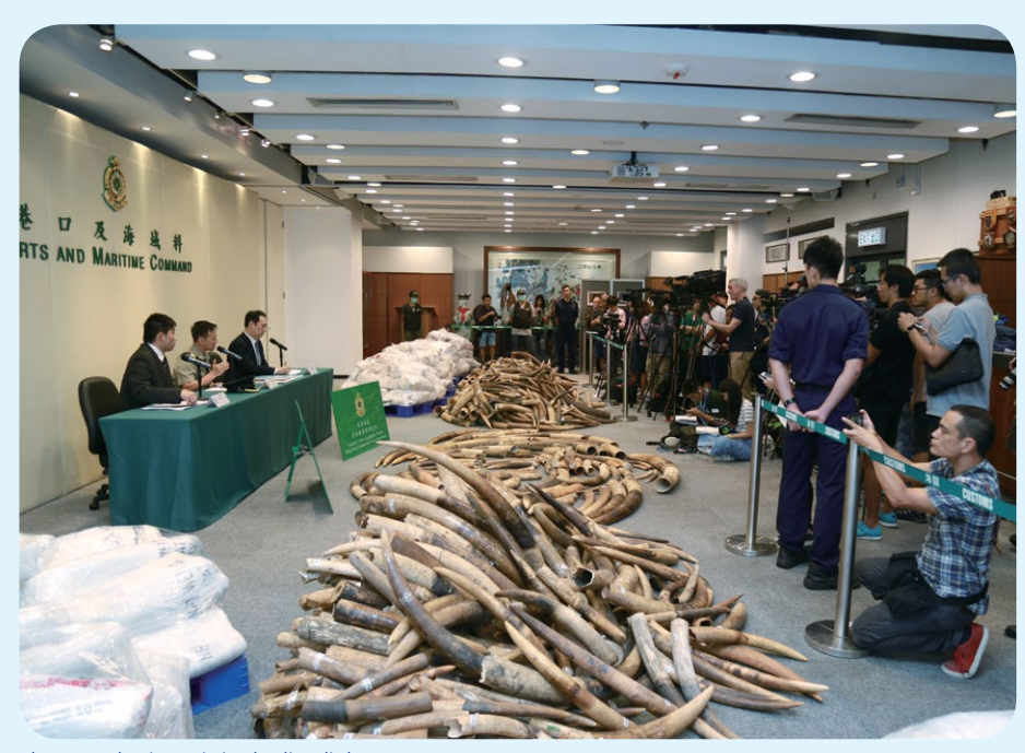
The record seizure is in the limelight.

Hong Kong Customs made a worldrecord seizure when officers from the Ports and Maritime Command detected 7 031 kilogrammes of raw ivory tusks valued over HK$70 million on July 4 last year. The items were found from a sea container arrived at Hong Kong from Malaysia. Allegedly packing with frozen fish products, officers discovered ivory tusks instead underneath piles of the fish products. The mega seizure by Hong Kong Customs also sets a new world record in the Elephant Trade Information System (ETIS) database in terms of the quantity of raw ivory tusks seized in a single case.