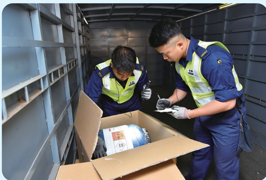
Customs officers discover hazardous materials during cargo examination.

Witnessed by over 40 observers from other formations, Macao Customs, ICTU and the Department of Health, the exercise has enhanced participants’ counter-terrorism awareness and showcased Custom’s preparedness and response plans in tackling terrorism-related incidents and emergency situations.