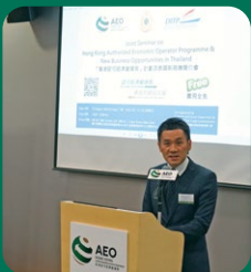
Joint Seminar with Overseas Trade Commissions