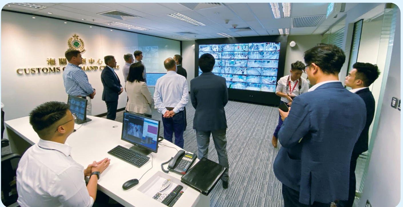
Seven new overseas Customs attachés visit the Customs Command Centre at Hong Kong West Kowloon Station during a familiarisation visit to various control points on November 13 last year.

Office of Customs Affairs and Co-operation