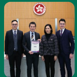
Civil Service Outstanding Service Award