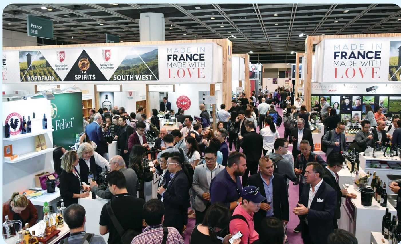
Hong Kong Customs reached out to the industry to promote the Wine Facilitation Scheme at the Hong Kong International Wine & Spirits Fair 2019 held at the Hong Kong Convention and Exhibition Centre on November 8 last year.

Office of Dutiable Commodities Administration