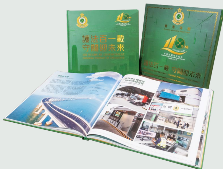
The C&ED 110th Anniversary Photo Album recorded the Department’s significant milestones over the past few decades.

In addition, Hong Kong Customs and Hongkong Post jointly produced the “C&ED 110th Anniversary Commemorative Stamp Pack”. This set of commemorative stamp pack not only contains a series of representative photos reflecting Customs officers’ training hardship, professional enforcement and excellent commitment, but also comes with Hongkong Post’s 2019 Year of the Pig Commemorative Stamp. Besides, the Department has designed a series of souvenirs to be distributed