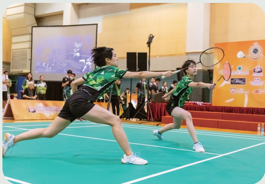
The Hong Kong Customs 110th Anniversary Charity Badminton Tournament was held on September 7 last year at the Disciplined Services Sports and Recreation Club.

Life Warrior Society, a local non-profit-making charity organisation assisting cancer child patients, to benefit more needy children and their families.