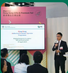
Promotion at Fair and Exhibition

To enhance the vital role that Hong Kong Customs plays in facilitating legitimate trade, Office of Supply Chain Security Management (OSCS) has been putting tremendous efforts in promoting Hong Kong Authorized Economic Operator (AEO) Programme and has achieved satisfying results last year in expanding its network.