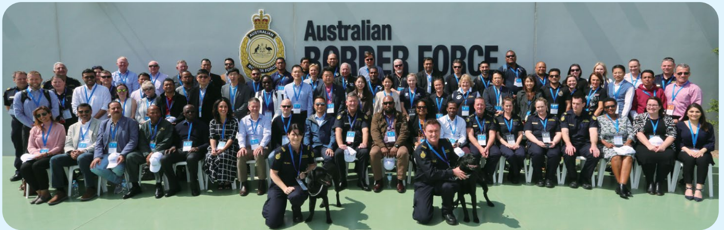
Participants of the "Fifth WCO Global Canine Forum" pay a visit to the purpose-built world class training facility for the Australian Border Force Detector Dog Programme.

The forum served as an effective platform for representatives from different customs administrations