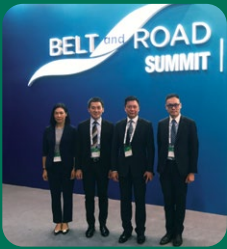
Belt and Road Summit 2019