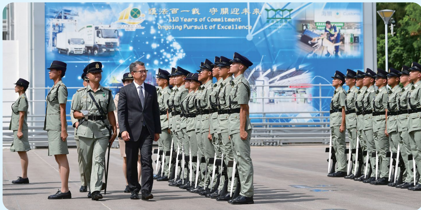
Financial Secretary Mr Paul Chan inspects Customs and Excise Rifle Squad at the passing-out parade held in August last year.