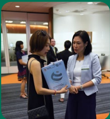
Interaction with Traders