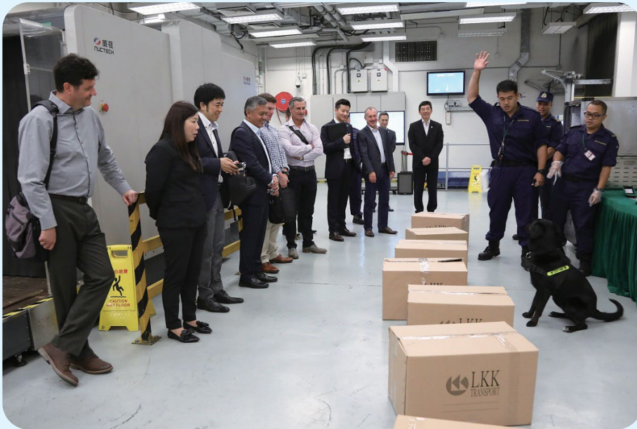
Seven new overseas Customs attachés watch a drug detection demonstration by Customs detector dogs at a cargo terminal of an airline company during a familiarisation visit to various control points on November 13 last year.

Customs attachés on November 13 last year.