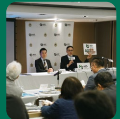
Seminar for Trade Association