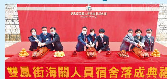
■ Directorate officers and guests prayed for the newly completed staff quarters.

The construction of the long-awaited Wong Tai Sin Sheung Fung Street Customs Staff Quarters was completed and ready for application. Its inauguration ceremony was held on 10 November 2022 with the attendance of Directorate officers. A ritual was held during the ceremony to pray for residents' safety, health and prosperity.