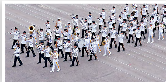
■ The ceremony opens with a military tattoo conducted by the disciplined services band, which comprises members of the Hong Kong Police Force, the Customs and Excise Department, the Immigration Department and the Correctional Services Department.