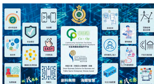
■ Different functions and features of the Co-Op

The Co-Op has received the Smart Business (Solution for Business and Public Sector Enterprise) Bronze Award at the Hong Kong ICT Awards 2022. The Judging Panel complimented Customs on its swift action in developing the Co-Op within just seven days and this great speed was never seen in other government projects.