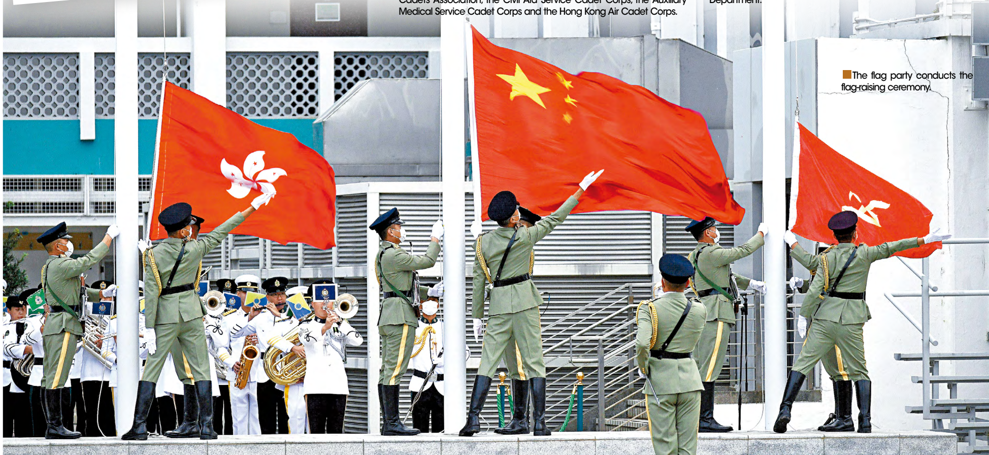
■ The flag party conducts the flag-raising ceremony.