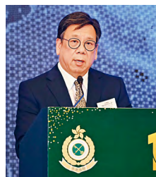
■ Speaking at the ceremony, the Secretary for Commerce and Economic Development, Mr Algernon Yau, expresses appreciation for the Hong Kong AEO Programme's development and achievement since its implementation a decade ago.