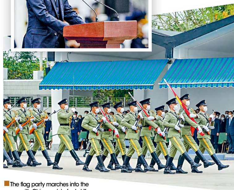
■ The flag party marches into the venue with Chinese-style foot drill.