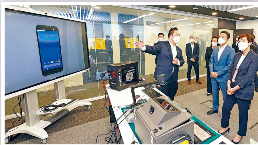
■ The Commissioner and other senior officials were briefed by computer forensic expert on the use of various forensic tools.

The expansion of the Computer Forensic Laboratory (CFL) was completed in November 2022. To tackle the rising trend of advanced technology crime and cybercrime as well as to cope with the ever-increasing workload, Hong Kong Customs continues to invest in computer forensics, including increasing manpower, equipment and office area. The newly expanded office enhances CFL's capability in providing forensic support and improves the work environment of our colleagues. The new multi-purpose room can facilitate various forms of meetings and trainings. CFL will strive to tackle advanced technology crime and provide better professional forensic support to the Customs.