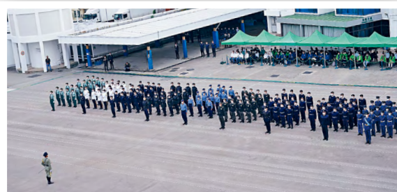
■ The nine youth groups participating in the foot drill are Junior Police Call, Rehabilitation Pioneer Leaders, the Fire and Ambulance Services Teen Connect, the Customs Youth Leader Corps, the Immigration Department Youth Leaders Corps, the Hong Kong Army Cadets Association, the Civil Aid Service Cadet Corps, the Auxiliary Medical Service Cadet Corps and the Hong Kong Air Cadet Corps.