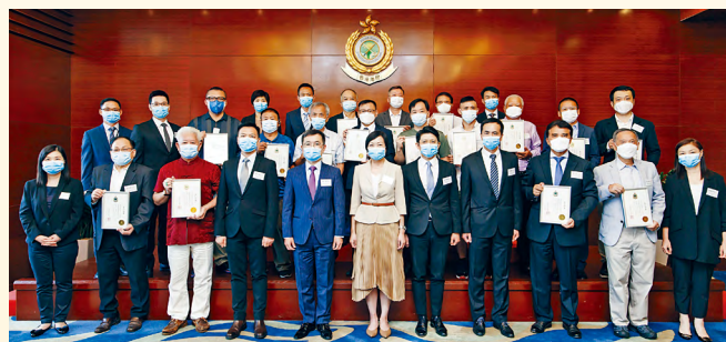
■ The inaugural ceremony of three liaison groups in logistics and transport industries was held September 2022.

The inaugural ceremony and meetings of the Cross Boundary Transport Industry Customer Liaison Group, the Road Cargo System (ROCARS) User Liaison Group and the Transshipment Cargo Clearance Facilitation Customer Liaison Group for 2022-24 were held September 2022. Members were presented with Certificates of Appointment. These three liaison groups offer an effective communication platform for the cross-boundary transport industry to exchange views with Hong Kong Customs and other government departments. Customs will continue to strengthen connection with the industry through the liaison groups.