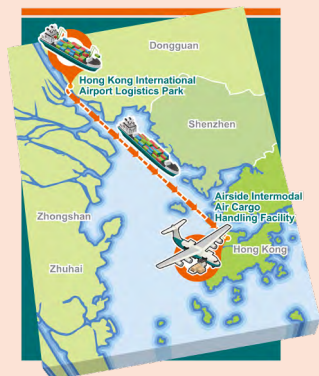
■ Sea-air transshipment cargoes are conveyed by a vessel to Airside Intermodal Air Cargo Handling Facility.

The Chief Executive announced in his 2022 Policy Address that the Government will reinforce intermodal transport by integrating air, sea and land transport to strengthen the key role played by Hong Kong in the logistics chain of the Guangdong-Hong Kong-Macao Greater Bay Area (GBA). The Airport Authority Hong Kong is actively taking forward various projects and adopting the intermodal transport mode to enhance connectivity between the airport and the GBA cities. It has set up the "Hong Kong International Airport Logistics Park" in Dongguan and the "Airside Intermodal Air Cargo Handling Facility" at the Hong Kong International Airport to facilitate sea air-cargo transshipment between Hong Kong and the Greater Bay Area. Under this pilot scheme, Customs provides one-stop customs clearance service for sea-air transshipment cargoes and applies technology to reduce the need for cargo inspection under manageable smuggling risks. These measures can expedite the cross-boundary flow of transshipment cargoes and uphold Hong Kong's role as a logistics hub.