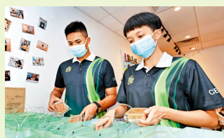
■ The probationary inspector trainees assisted in distributing anti-epidemic care packs and gift boxes to send warmth to the elderly during the Mid-Autumn Festival.

This experience also reminds us to be more helpful when possible. We should go the extra mile when we can. In the future, in addition to shouldering the responsibility of upholding the law and guarding Hong Kong, I will also make good use of my ability to help those in need in society.