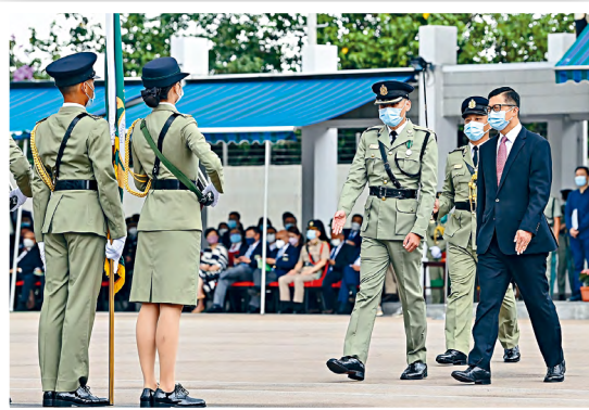
■ Secretary for Security, Mr Tang Ping-keung, inspected the Probationary Customs Officers at the passing-out parade in June 2022.

Mr Tang emphasised in his speech that the department's essential role in Hong Kong's transition from chaos to order. He also appreciated the continuous efforts made by the department in cultivating young Customs talents to be the "gatekeepers" of Hong Kong.