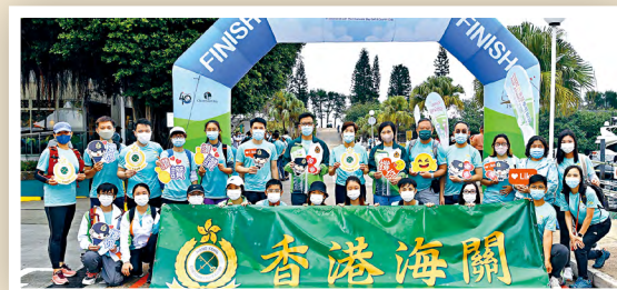
■ Colleagues actively participated in and completed the 3.5 km charity walk with sweat and effort to raise funds for the Health Express on the prevention and treatment of blindness in the Mainland.

This event was a charity walk organised by Lifeline Express to raise funds for the prevention and treatment of blindness in the Mainland. The guest of honour, the Secretary for Security, Mr Tang Ping-keung, led the heads of the disciplined services to kick off the fundraising activity. Colleagues and Customs YES members actively participated in the activities. Under the theme of "Hope in Every Step", they completed the 3.5 km race and raised funds for patients with eye disease who are in need, and to restore their vision and continue the sight saving mission of Lifeline Express.