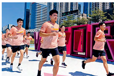
■ Officers of the Department actively participated in the Law Enforcement Torch Run for Special Olympics, completing a 3.5 km run with highlights filmed and shared to call for more participation, thereby raising more funds for the sports development of athletes with intellectual disability.

Department took the lead and joined the torch run. For promoting the event and appealing for active participation, the department has produced various short video clips capturing the fascinating scenes of our directorates, formations and colleagues during the run. The short video clips have been uploaded onto the departmental social media platforms for promoting healthy lifestyle and demonstrating the departmental endeavors and enthusiasm in charity. The donation received was the highest ever.