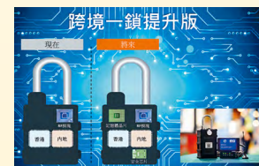
■ Aligned with the national safety standard, the new E-locks will help strengthen the cooperation between C&ED and the Mainland Customs in advancing clearance facilitation.

Customs previously received funding from the Innovation and Technology Bureau for conducting a comprehensive feasibility study on the ways to enhance the security level of the E-lock system and align the E-locks with the national safety standard. The study was completed in December 2021. The new E-lock System will be installed at all land boundary control points and clearance points in Hong Kong.