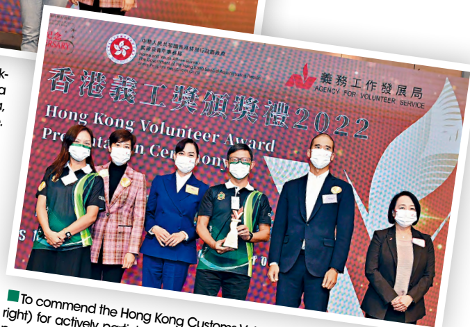
■ To commend the Hong Kong Customs Volunteer Team (first left and third right) for actively participating in voluntary work and providing services to people in need from different walks of life, the Volunteer Service Development Council awarded the "Outstanding Volunteer Team" to the Hong Kong Customs Volunteer Team.