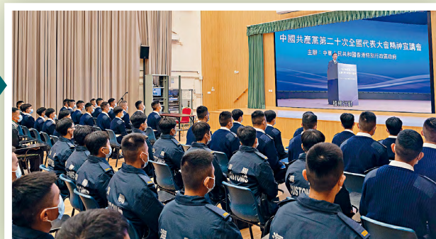
■ Customs arranges a seminar on the spirit of the 20th National Congress for new recruits, enabling them to understand more fully its specific content and significance.