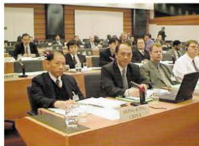
World Customs Organisation Group

The Enforcement Committee also reviewed and discussed on the global drug trafficking trend.