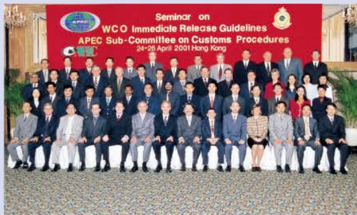
△ Participants of the APEC Seminar on the WCO Immediate Release Guidelines.