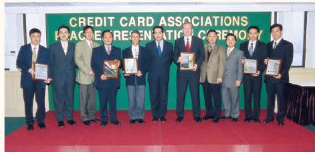
△ Senior Officers of the Customs and the Police together with the executives of the Credit Card Associations at the plaque presentation ceremony.