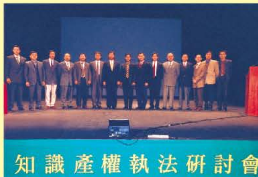
△ Senior management of the IPIB at the training seminar on IPR operations.

Intellectual Property Investigation Bureau