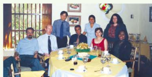
Controlled Chemicals Group