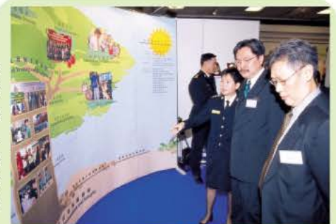
△ Commissioner John C Tsang being briefed on the contents of the exhibition booth.

Our booth displayed a number of self-developed training videos, self-learning interactive CD-ROMs, extendable baton training equipment, seized counterfeit goods and pirated discs.