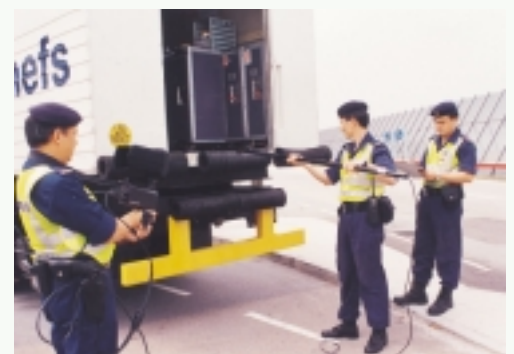
△ Officers of Airport Command using the Search System with Video Aids to search a catering truck