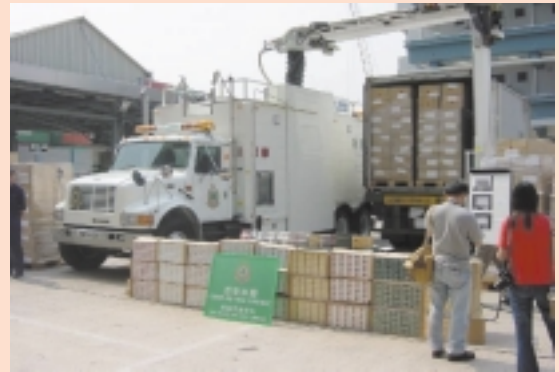
△ The dutiable cigarettes seized by officers of the Ship Search and Cargo Command with the aid of the Mobile X-ray Vehicle Scanning System