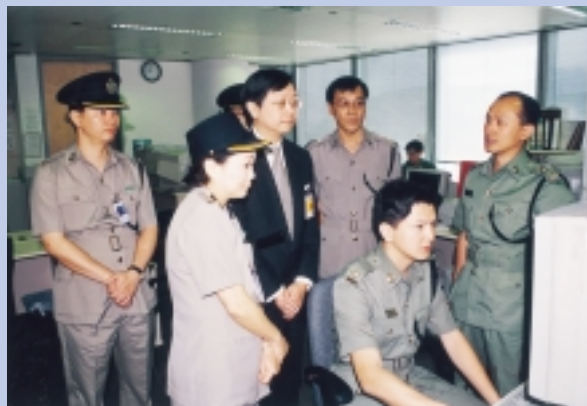
△ Commissioner Raymond Wong watching the demonstration on the functioning of the Air Cargo Clearance System.