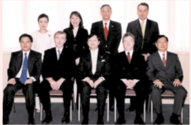
△ The participants of the Fourth Customs Co-operation Conference between New Zealand and Hong Kong.