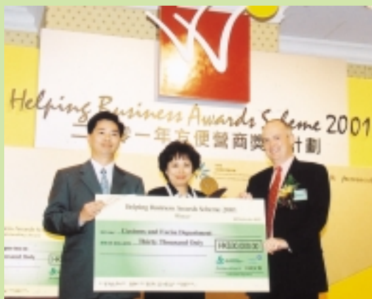
△ Representatives of Airport Command receiving the cheque in the presentation ceremony.

Airport Command and Office of Dutiable Commodities Administration