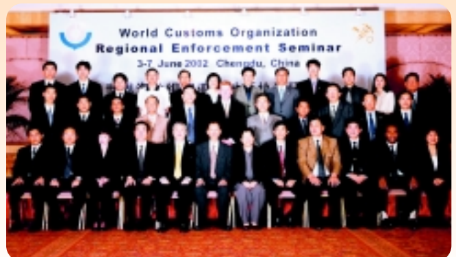
△ Participants of the WCO Regional Enforcement Seminar.

WCO and APEC Division Customs Liaison Bureau