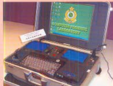
Portable Digital Evidence Acquiring Computer.