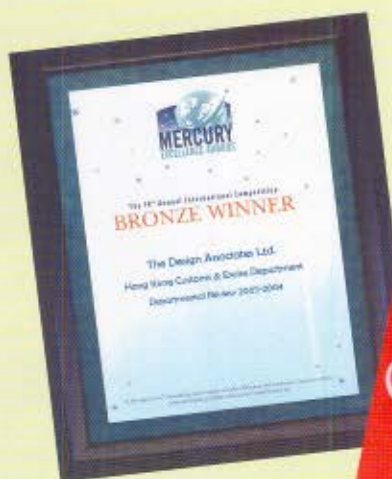
Certificate of Bronze Winner of MERCURY Awards Competition.