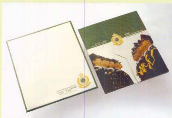
The Customs and Excise Departmental Review 2003-2004.

The award-winning publication, covering major achievements and developments of Customs in 2003/04, aimed to enhance public understanding of the work of Customs.