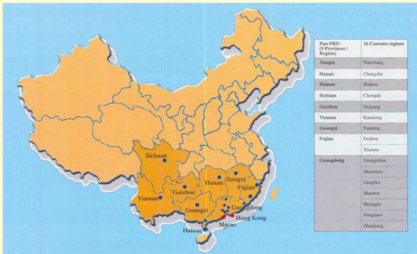
Location Map of the Customs Administrations of Hong Kong, Macao and the Nine Provinces / Regions of Pan-PRD.

Last year, the Department maintained its vigorous efforts in law enforcement. We adopted an intelligence-led strategy and worked closely with our Customs counterparts and other law enforcement agencies to combat various kinds of illegal activities. We detected a total of 53, 286 cases, leading to the