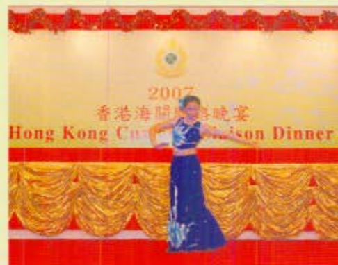
Performance by Mainland Customs at the Annual Liaison Dinner, which was held after International Customs Day reception.