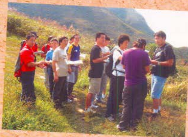
Photo shows participants locating direction from the map during the field training. They had to reach a destination near Kowloon Peak by a less-travelled path covered by shrubs and bushes.

Twenty-five officers of Special Task Force attended a Tactical Wilderness Navigation Course organised by the Civil Aid Service Training School on October 13, 2006. It was arranged to heighten frontline officers' safety awareness when they conducted surveillance in the wild.