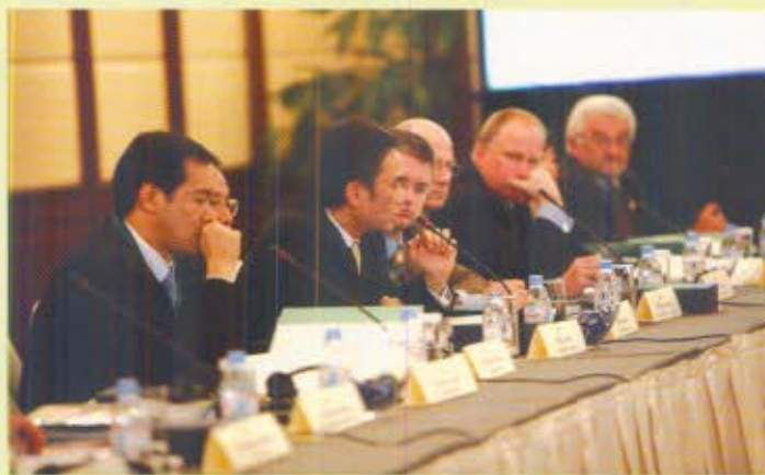
Group Head (Drug Investigation) of Hong Kong Customs, Mr John Lee (third left), sharing with participants the success of international cooperation in combating drug trafficking.

Attendees of Seminar included representatives from the Anti-smuggling Bureau of General Administration of the Customs, the Anti-smuggling Bureau of the Guangzhou Customs District of the PRC, the Anti-smuggling Bureau of the Shenzhen