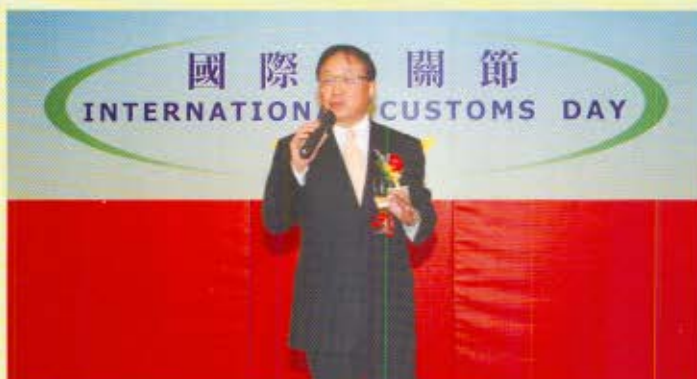
Honorary President of the Hong Kong Performing Artists Guild, Mr Michael Hui, staging a "stand-up comedy". While commending enforcement ability of Customs Drug Detector Dogs, he joked that if genuine optical discs were added strawberry scent, it would facilitate Customs Drug Detector Dogs to detect pirated optical discs at all control points.