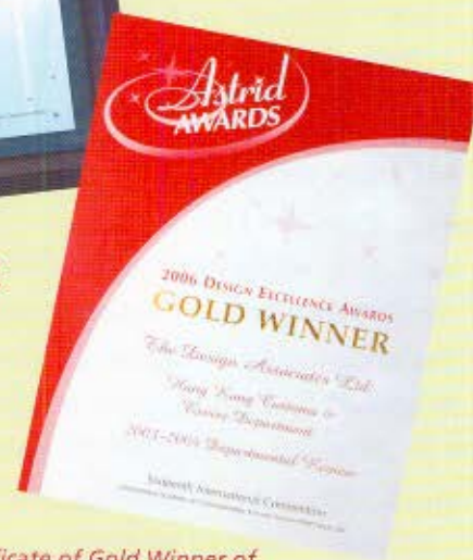
Certificate of Gold Winner of ASTRID Awards Competition.

It covers enforcement of the Department in anti-smuggling, trade facilitation, narcotics interdiction, intellectual property rights protection, revenue collection and consumer protection.