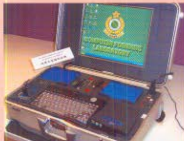
Portable Digital Evidence Acquiring Computer.