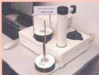
Optical Disc Analyzer.

Optical discs are inserted automatically to the computer for scanning and analysis.