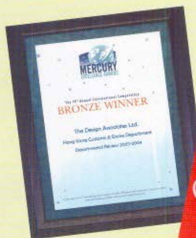
Certificate of Bronze Winner of MERCURY Awards Competition.