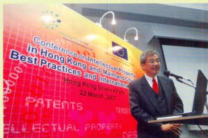
Commissioner Tong speaking on Customs anti-piracy enforcement at the international conference co-hosted by the European Commission and Hong Kong Science and Technology Parks Corporation.