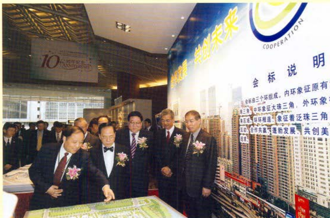
Minister of the General Administration of Customs (GAC) of the People's Republic of China, Mr Mu Xinsheng introducing to the Chief Executive of HKSAR, Mr Donald Tsang, the model of Shenzhen Bay Port Passenger Terminal Building.

He noted that C&ED has played an important role in the economic development blueprint of the