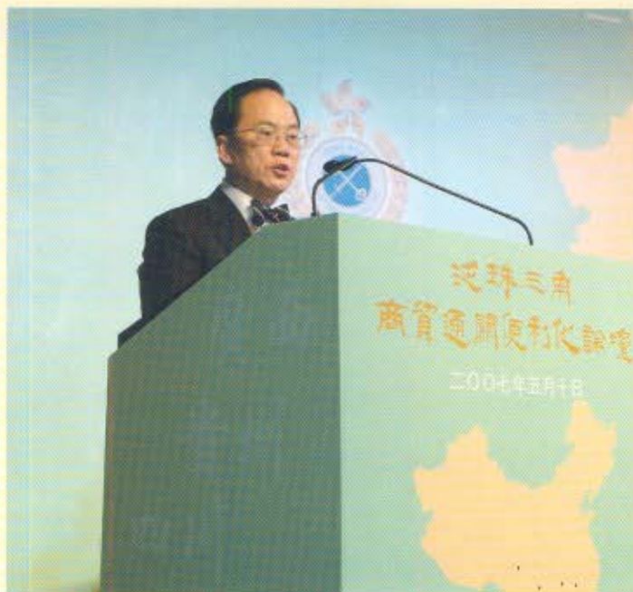
The Chief Executive of HKSAR, Mr Donald Tsang, delivering a speech at the opening ceremony of the Pan-PRD Customs Trade Facilitation Forum.

Pan-PRD region, and has served as a bridge connecting our country with the world in promoting economic activities between different areas and expediting the passenger and cargo flow.