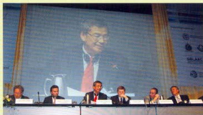
Commissioner Tong (third left) sharing at the panel discussion of "The Third Global Congress on Combating Counterfeiting and Piracy" Hong Kong's success in enlisting support from the youth for IPR protection through the Youth Ambassador Against Internet Piracy Scheme.

Complementing this is the invocation of the Organized and Serious Crimes Ordinance (OSCO) to restrain criminal proceeds derived from piracy and counterfeiting activities. Since 2004, Customs has invoked OSCO six times, freezing up to $97 million worth of assets.