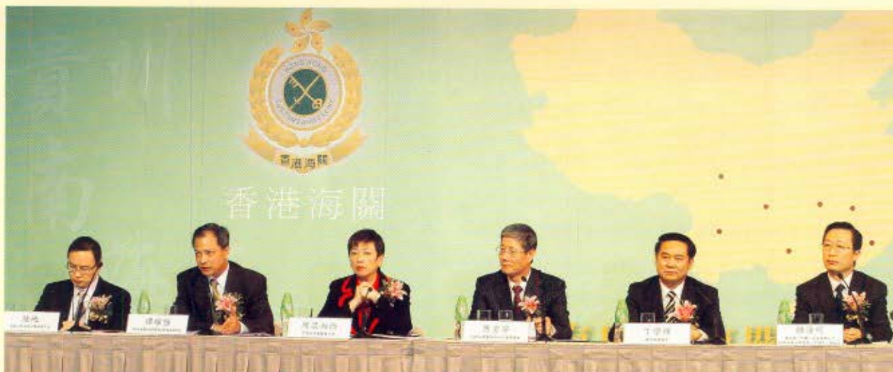
Moderators and speakers of the Panel Discussion on "Strengthening the Cooperation between Mainland, Hong Kong and Macao Customs in Protecting Intellectual Property Rights".