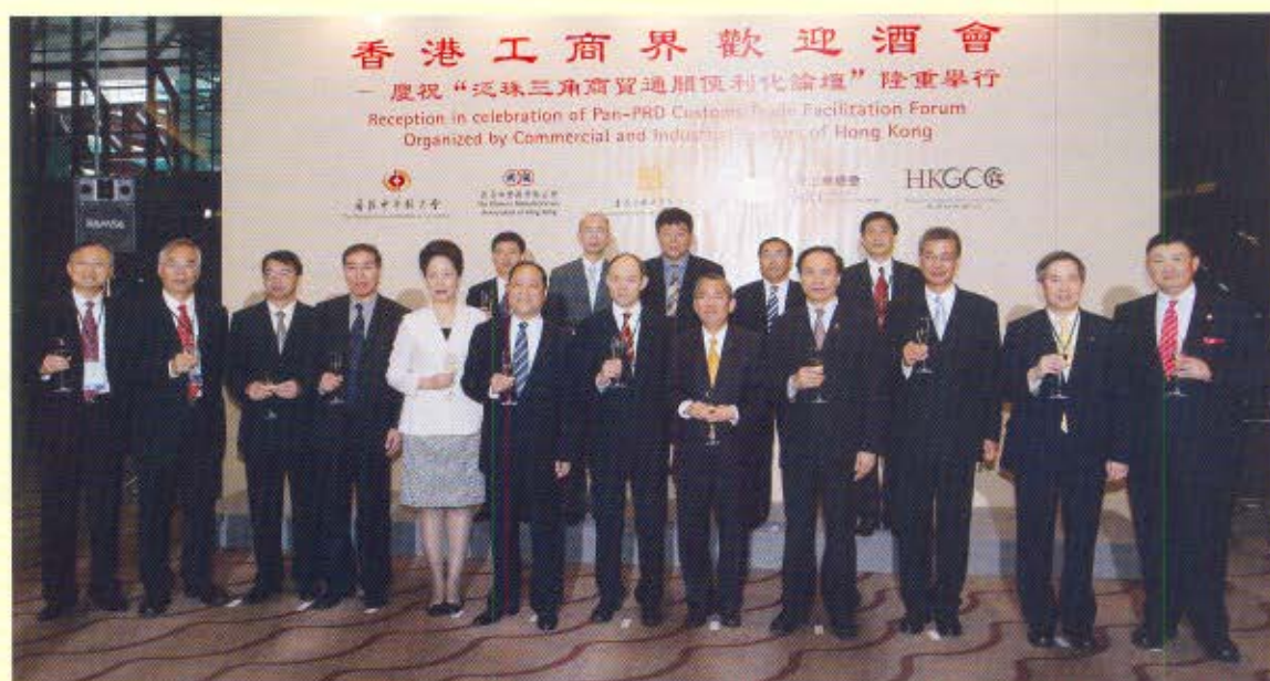
Guests being invited to toast in the cocktail reception organized by the commercial and industrial sectors of Hong Kong during the Pan-PRD Customs Trade Facilitation Forum.

In the context of the eight co-operation projects, the Hong Kong Customs will work towards three specific aims in the coming year.