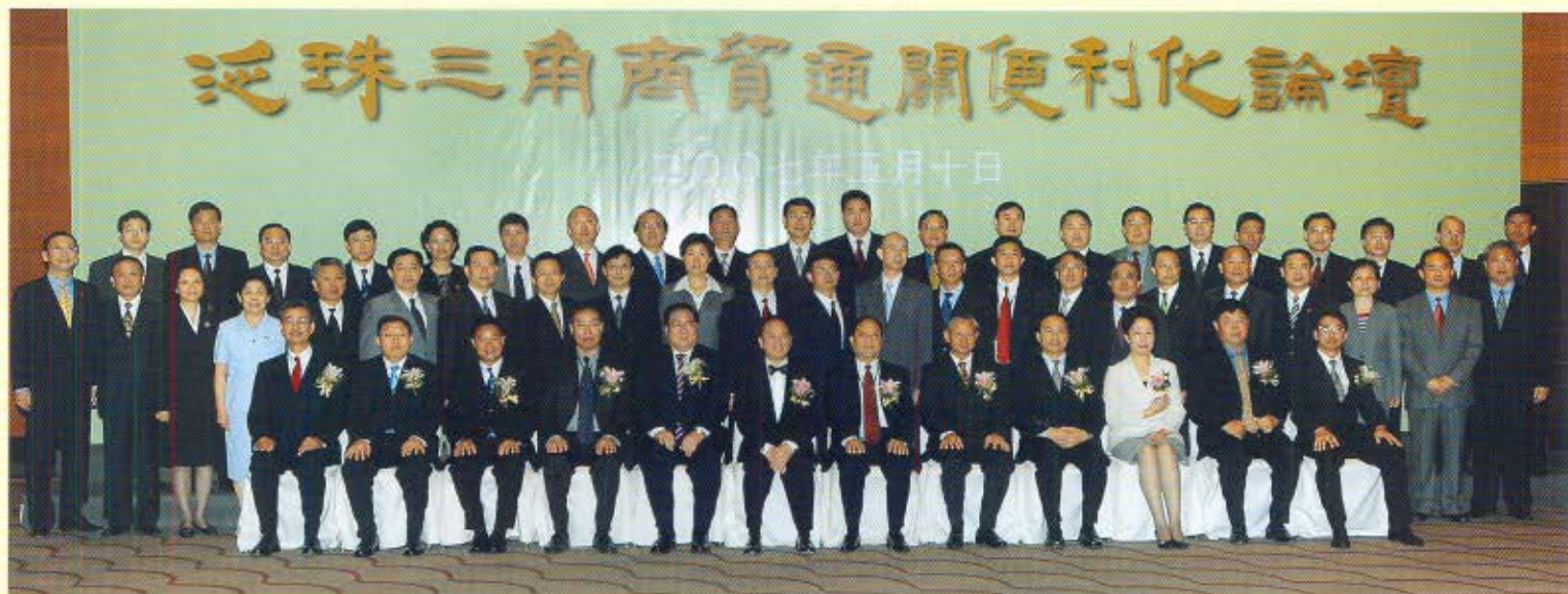
Customs Commissioners from the Pan-PRD Region, Hong Kong and Macao as well as business sectors of the region participating in the Pan-PRD Customs Trade Facilitation Forum to explore ways of promoting regional trade and commerce.

At the Regional Customs Commissioners Joint Conference held on 11 May, a Letter of Intent for the Implementation of Eight Co-operation Projects