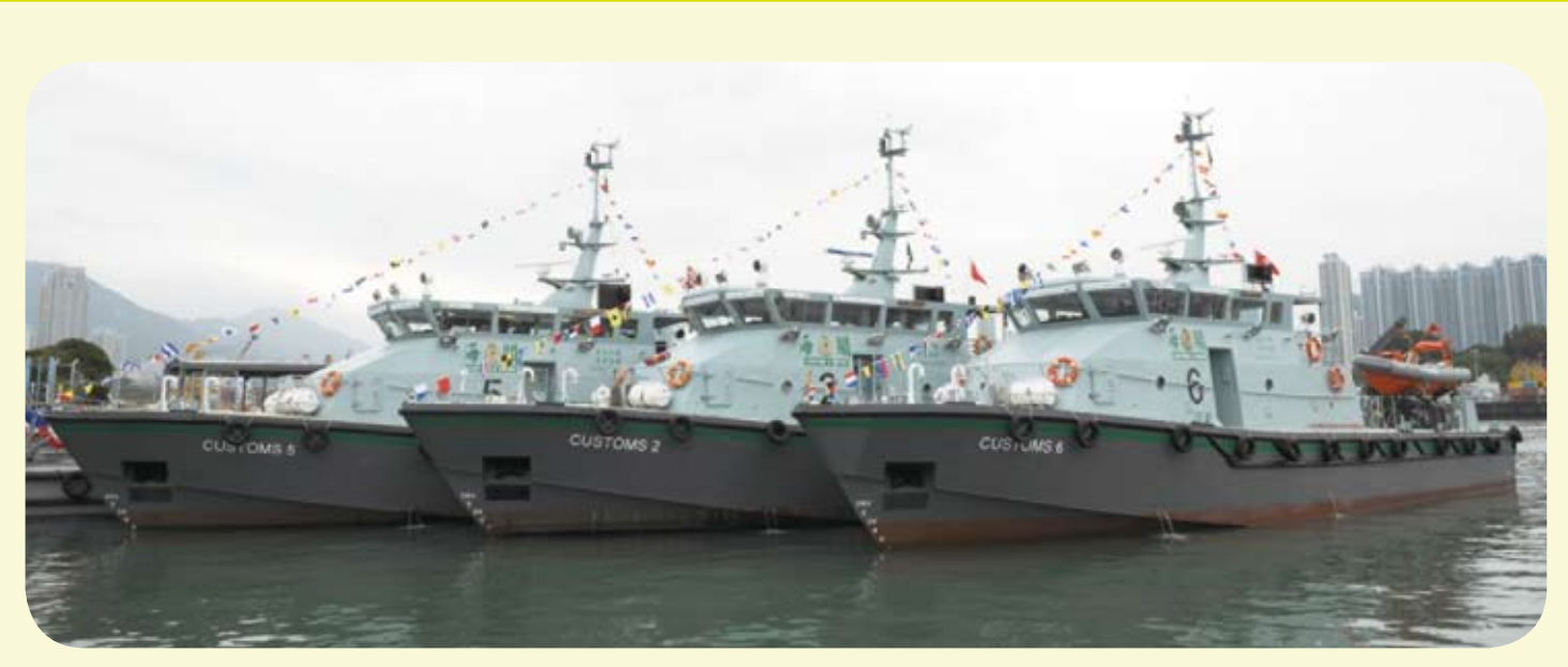
The three Customs Sector Patrol Launches have been in service since December 17, 2009.

With these three new patrol launches coming in service, the effectiveness and efficiency of Hong Kong Customs antismuggling operations is substantially enhanced and greater deterrence is posed on sea smugglers.