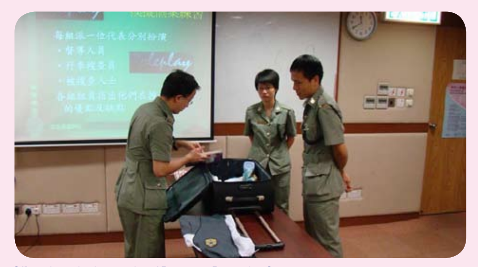
Officers in a role play exercise of Passenger Processing Course.