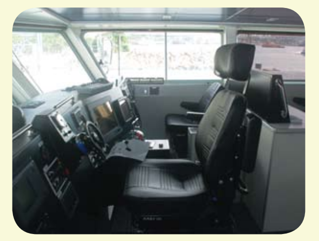
The new launches are equipped with enhanced maneuverability.