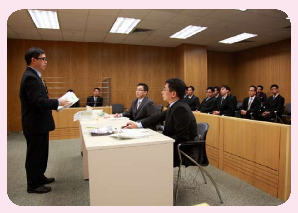
Officers in a mock trial training of Intelligence and Investigation Course'.

All of the three courses adopt a scenario-based teaching methodology. They are intended