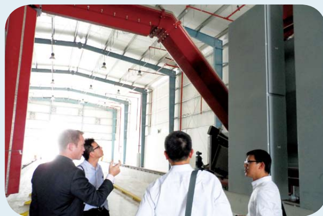
Mr Lai (second left) and Mr Hui (first right) study the gantry-type X-ray vehicle inspection system at Al Ghuwaifat Border Crossing.

on-site operations, performance and maintenance services of the X-ray scanning system. The visits help the Department formulate the procurement strategy for the Customs clearance equipment of the infrastructural projects under planning.