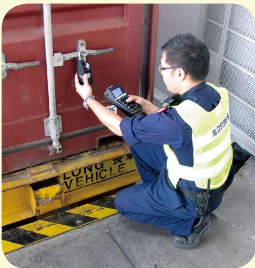
Customs officer uses a handheld device to activate the electronic lock.

According to ITFS, the Customs will normally inspect the transshipment cargo at either entry or exit control