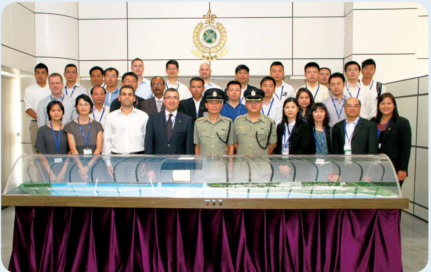
The participants of the Intellectual Property Crime Regional Training Seminar visit the Shenzhen Bay Control Point to see for themselves the work of Hong Kong Customs.