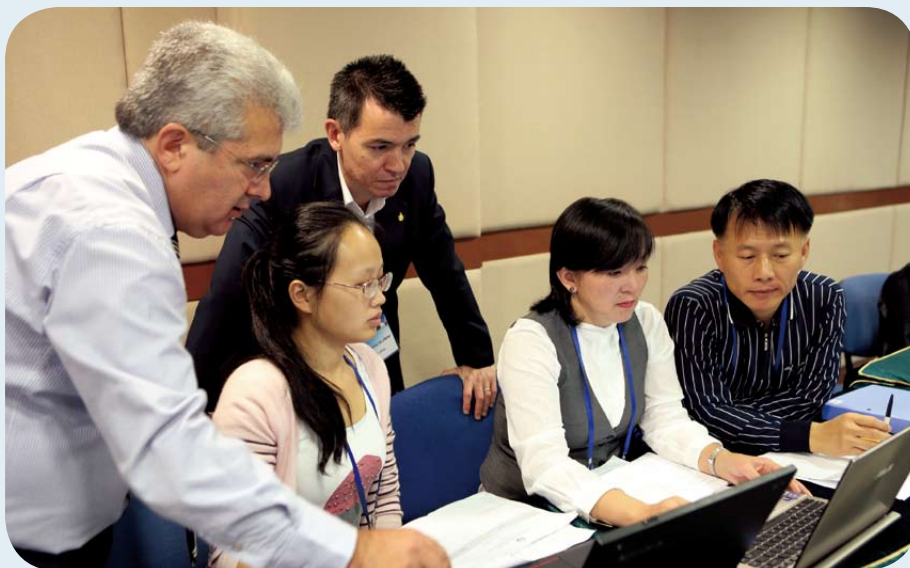
WCO facilitators at the workshop to advise the participants.

participants to accomplish field missions before they can be accredited as WCO experts on Risk Management.