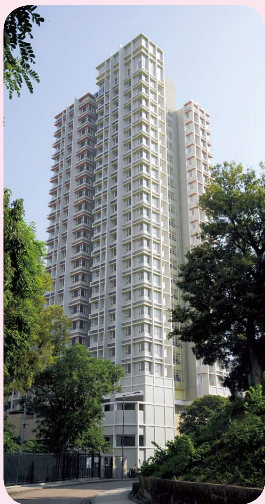
The new Tsing Chau Street Customs Staff Quarters.