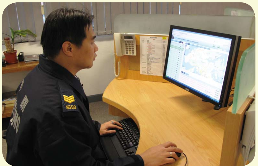
Customs officer can check the status of the electronic lock and the route of the truck through a web-based monitoring platform.