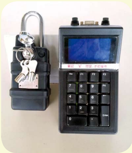
One type of the electronic locks and handheld devices used in ITFS.

point. Northbound transshipment cargo will be inspected upon its arrival at the Hong Kong International Airport (HKIA), Kwai Chung Customhouse or River Trade Terminal. Southbound air-land transshipment cargo will be inspected upon its departure at HKIA whereas southbound sea-land transshipment cargo will be inspected on arrival at a land boundary control point.