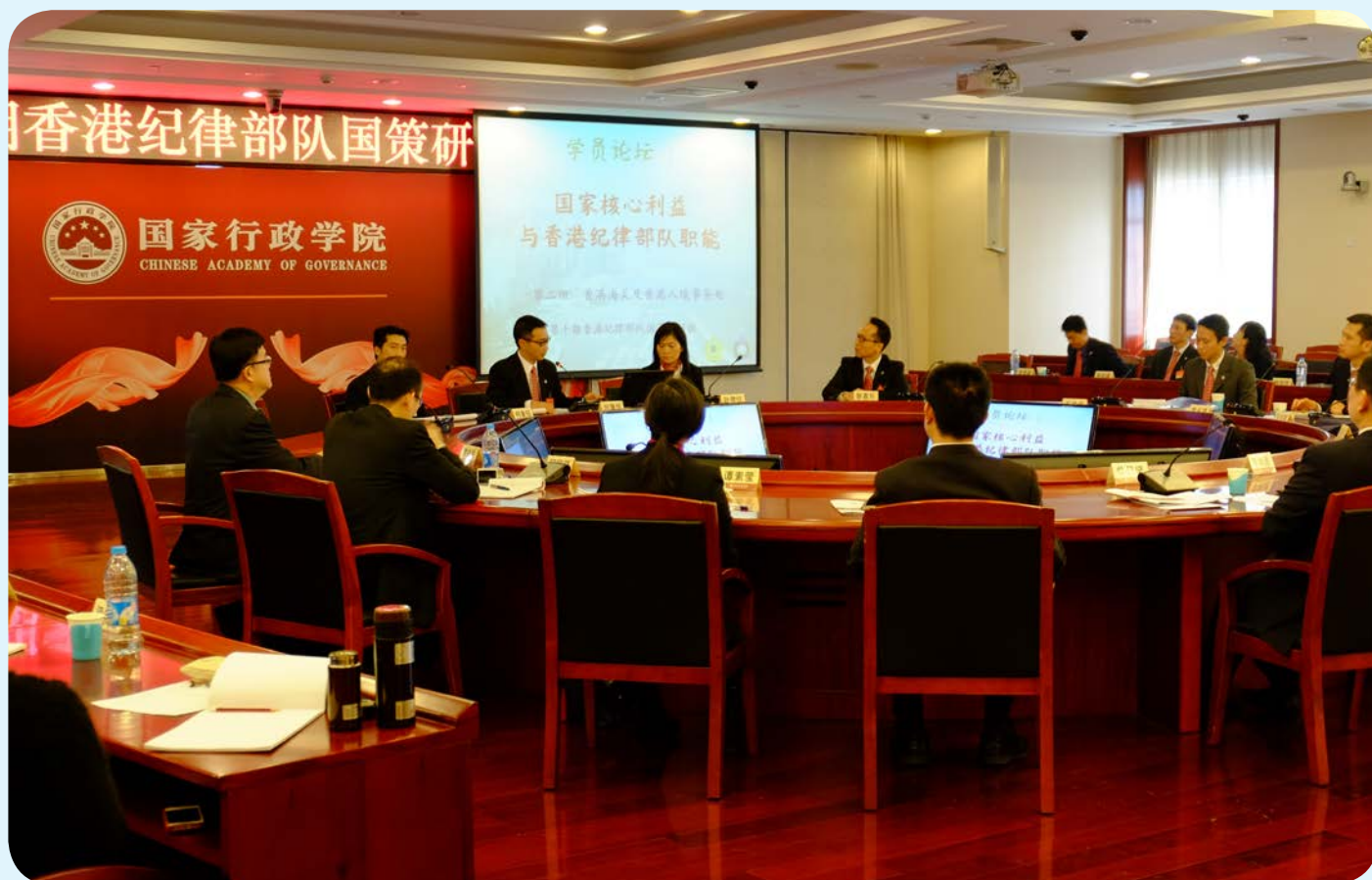
Participants deliver presentations.

The 12-day training programme covered contemporary strategies and cooperation between the enforcement agencies of the Mainland and HKSAR.