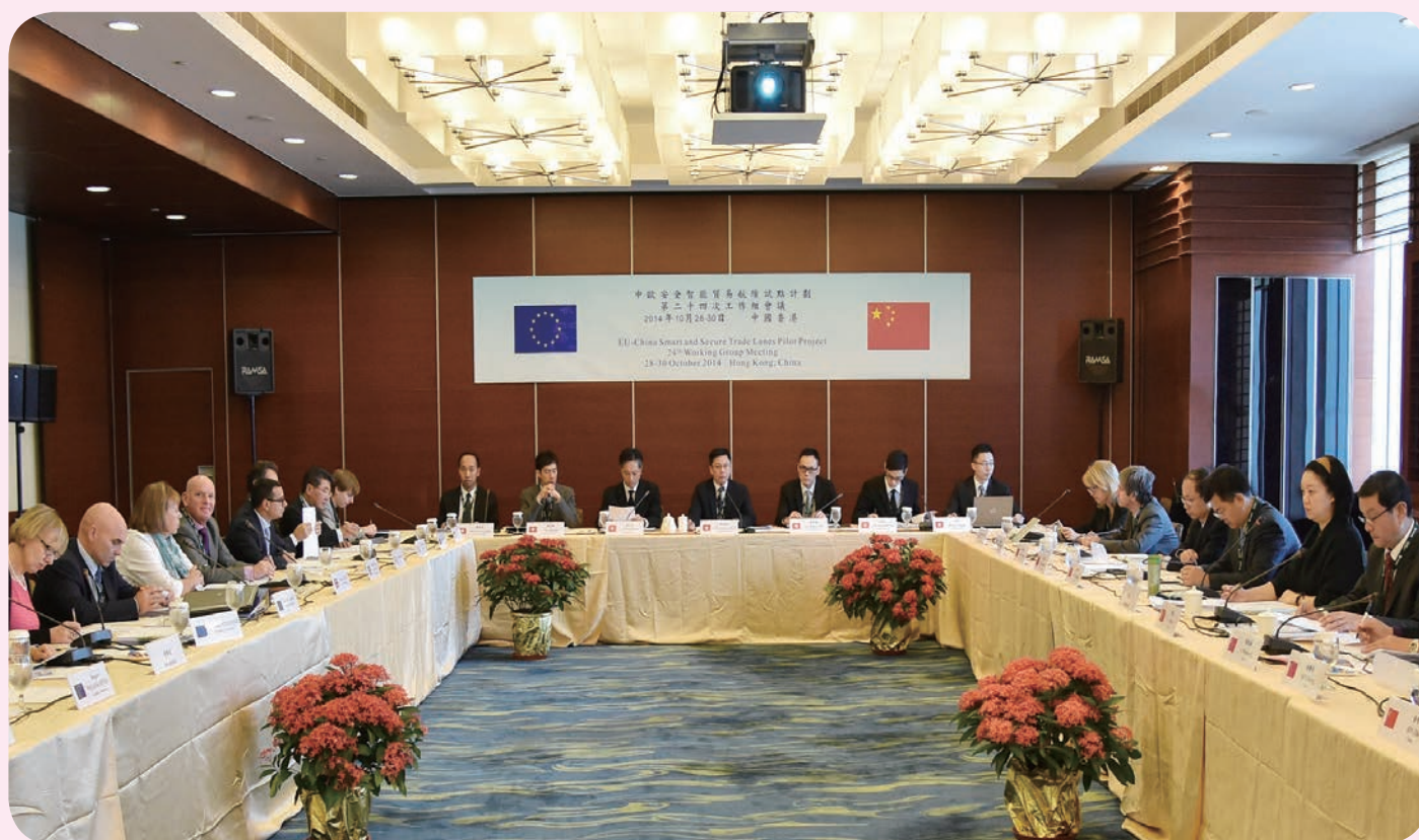
A glimpse of the meeting.