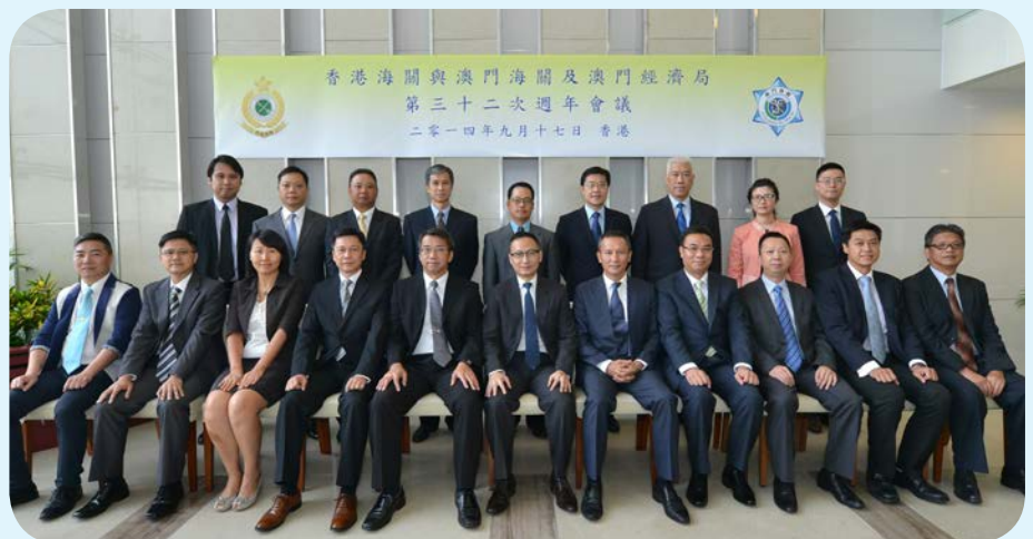
Delegations of the 32nd Annual Meeting between Hong Kong Customs and Macao Customs Service / Macao Economic Services.