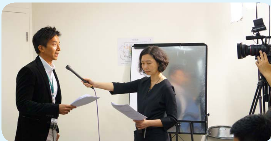
Training on stand-up interview by media.

The Higher Training Division of the Office of Training and Development organized the 17th Customs Command Course for 15 Senior Inspectors and three Senior Trade Controls Officers from November 6 to 28, 2014. The course helps equip participants with modern management skills and knowledge. Participants are expected to be able to put management concepts into practice in day-to-day operations and develop their leadership potential in meeting future challenges. Former senior government officials, experienced human resources management consultants and university