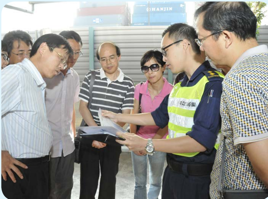
Mainland Customs director-grade officers visit Kwai Chung Customhouse Cargo Examination Compound.

The Office of Training and Development organized the “No.3 Customs Management Course” between October 20 and November 1, 2014 for 15 Mainland Customs director-grade officers from various Customs districts in Mainland China. The No. 3 Customs Management Course provided training to Mainland Customs participants on modern Customs management with classroom lectures, experience sharing and site visits to various Customs clearance facilities and museums. The course also provided a platform to promote the learning and sharing between the managerial officers of Mainland and Hong Kong Customs.