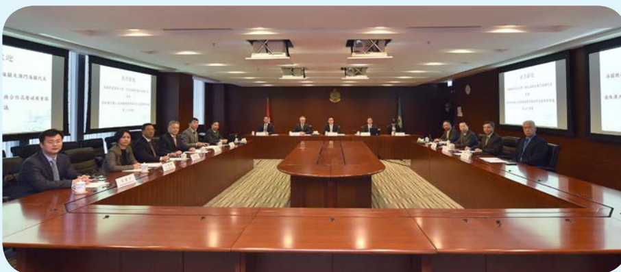
The 2nd High-Level Meeting for the Cooperation on Customs Clearance for the Hong Kong-Zhuhai-Macao Bridge with Guangdong and Macao delegations.

In addition, the 2nd High-Level Meeting for the Cooperation on Customs Clearance for the HZMB among Guangdong Customs, Hong Kong Customs and Macao