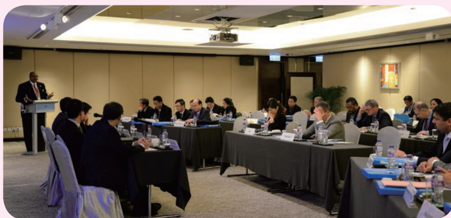
Participants exchange views on IPR enforcement strategies in the Workshop.

Office of Customs Affairs and Cooperation