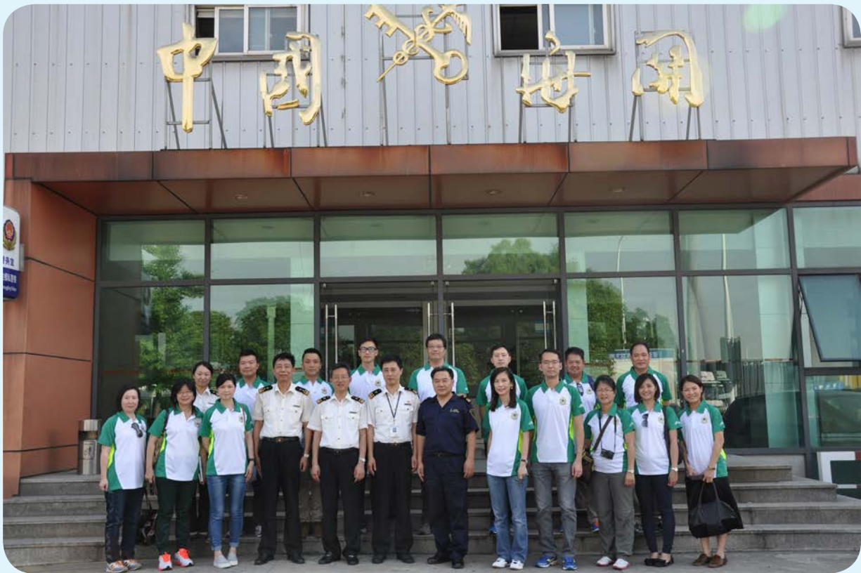
Hong Kong Customs' delegation with the Shanghai and Suzhou Customs Officials.