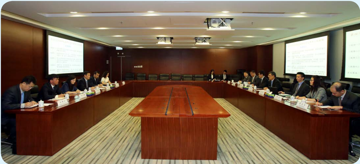
Hong Kong and Mainland Customs delegations exchange views at the 4th IT Expert Group Meeting.

developing economies, inter-connection among such systems into a regional network was the prominent trend. The APEC economies and ASEAN countries were expected to implement such a network in due course to further promote cross-border trade. Hong Kong was also advancing the Single Window development.