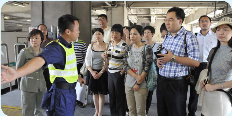
A Customs Officer introduces the facilities and operation of Kwai Chung Customhouse to the Guangdong Customs officers.

Mainland Customs officers enriched their understanding of the work of Hong Kong Customs and the development in Hong Kong. This course is conducive