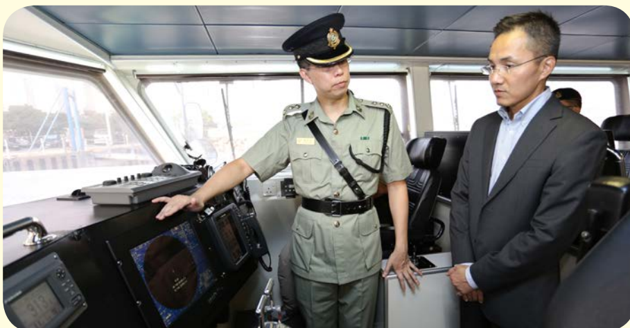
The Commissioner on board a Customs Sector Launch during his visit to the Ports and Maritime Command.

the latest one near completion with Malaysia, have been arranged in just four years.