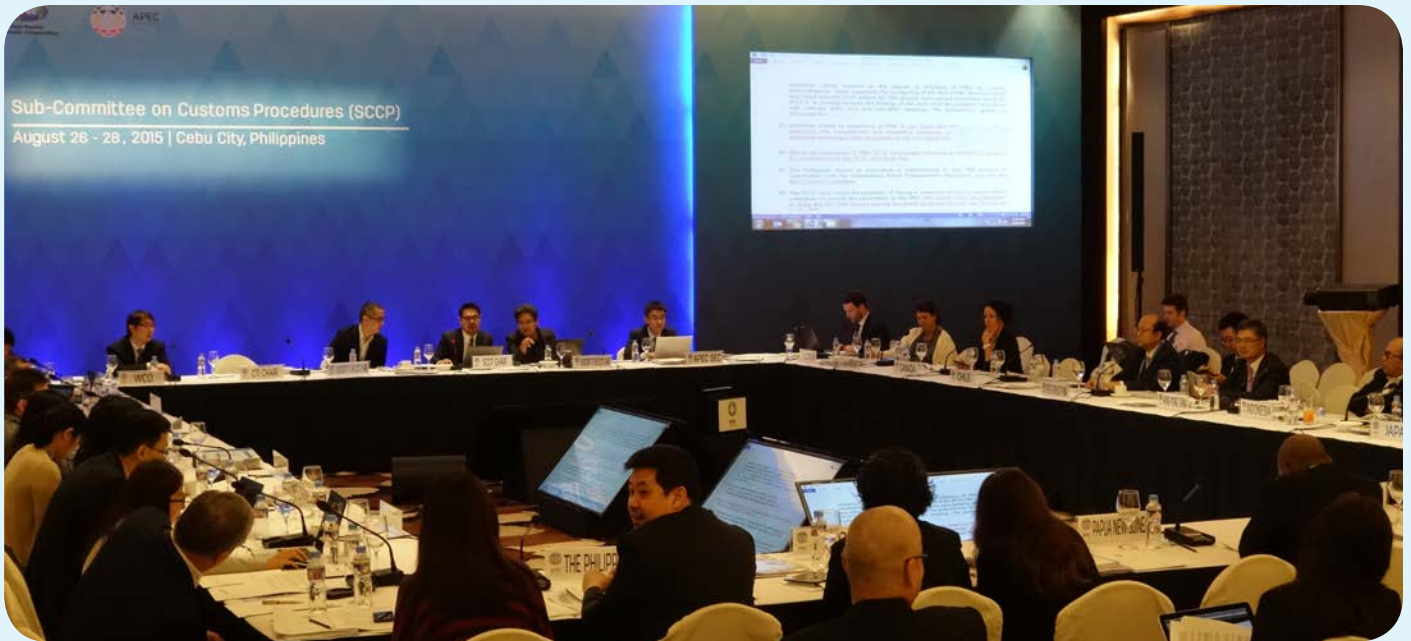
The 2015 2nd APEC Sub-Committee on Customs Procedure Meeting in progress.