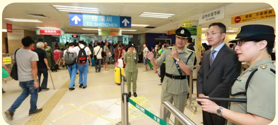
The Commissioner (second right) is briefed on Customs operations at Lowu Control Point.

On trade facilitation, clearance benefits offered to Authorized Economic Operators in Hong Kong and signatory economies with mutual recognition arrangements (MRAs) are well received. It is encouraging that six MRAs, including the one signed with the Mainland and