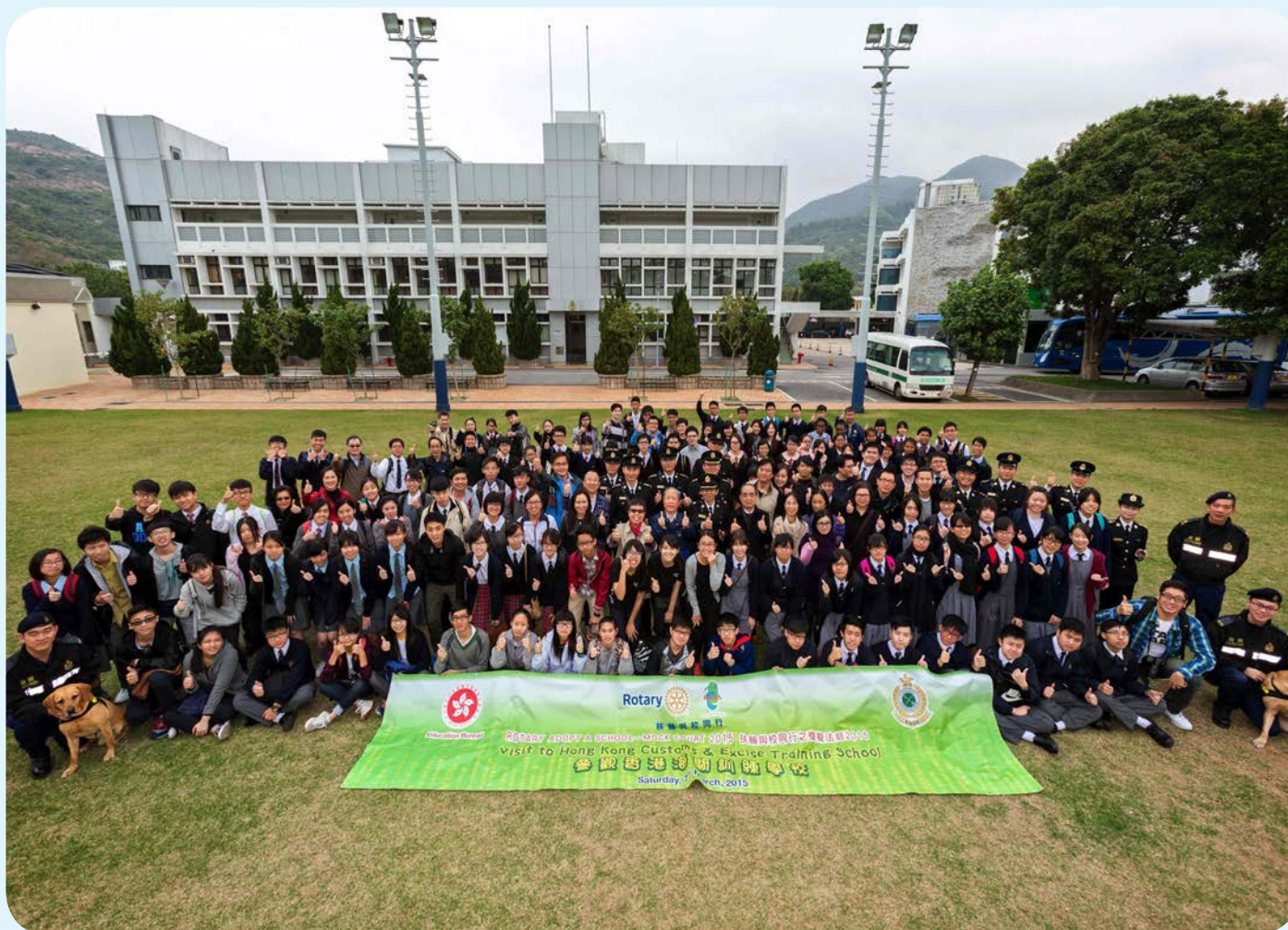
All participants in a group photo at Customs and Excise Training School.

In support of the Rotary “Adopt a School” Programme, the Customs and Excise Department organized a visit to the Department’s Training School and a mock court trial in High Court for over 150 secondary school students in March 2015.