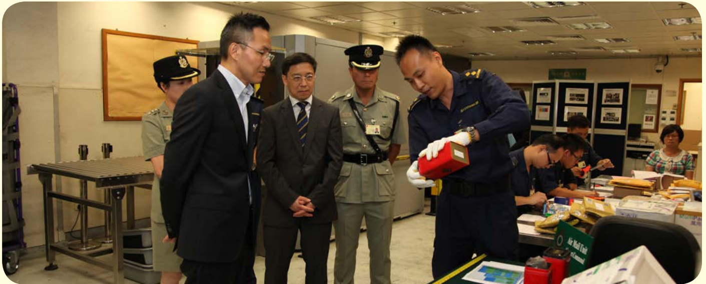
The Commissioner (left) visits the Air Mail Centre.

monitoring round the clock and also increases the efficacy in detecting suspicious cases.