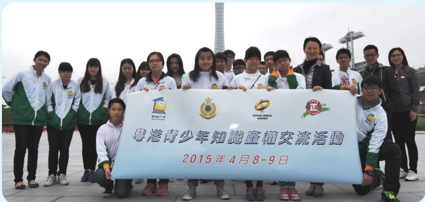
Youth Ambassadors at Guangzhou.