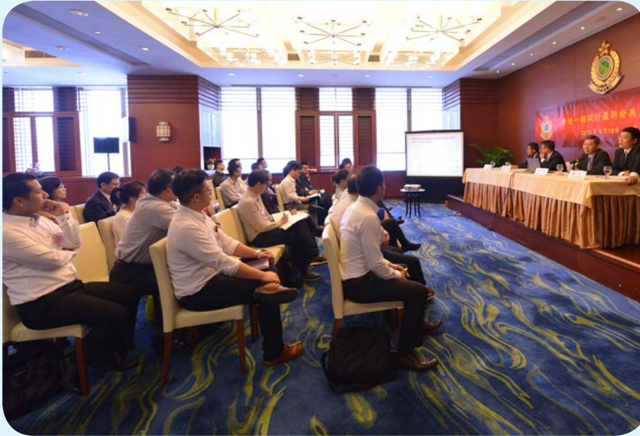
Hong Kong Customs and the Guangdong Customs brief the industry players of the latest development of the Scheme.

(e-lock) and Global Positioning System technology.