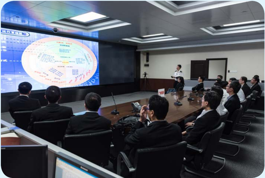
Participants visit the Risk Analysis and Monitoring Centre of Guangzhou Customs.

Customs administrations. Frontline officers built up a solid foundation for cross-boundary cooperation in tackling transnational smuggling activities.