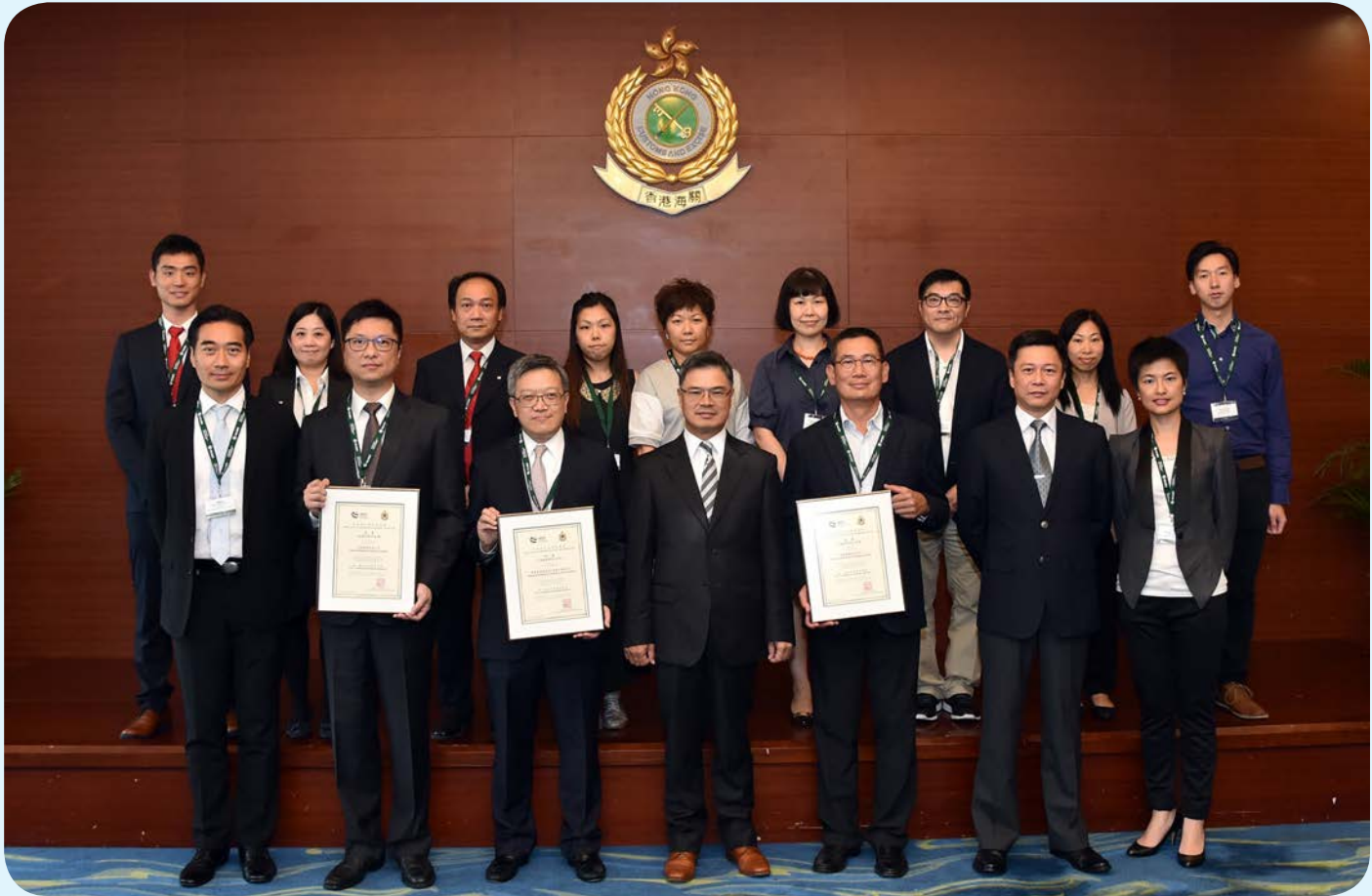
A group photo at the certificate presentation ceremony.

assisting them to tap into overseas markets.