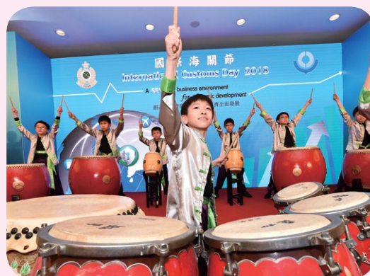
Chinese drum team of Ying Wa Primary School, "The Thunder Makers", make a marvelous performance at the opening of the 2018 International Customs Day reception.

Hong Kong Customs has celebrated the ICD since Hong Kong became