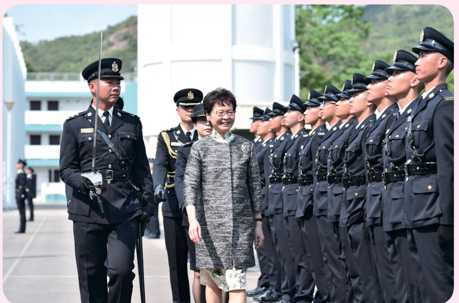
Chief Executive Mrs Carrie Lam inspects the Probationary Customs Officers at the passing-out parade.