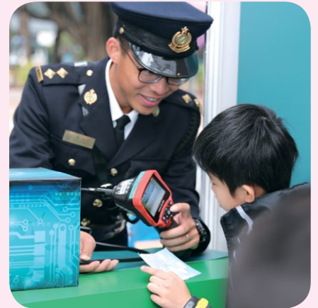
A boy shows strong interest in the interactive programmes at "Smart Customs" booth and workshop.

Thanks must also be given to the Logistics and Supply Chain MultiTech