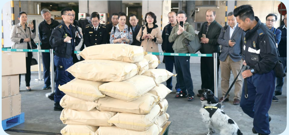
Course participants watch a demonstration by Customs Detector Dogs.