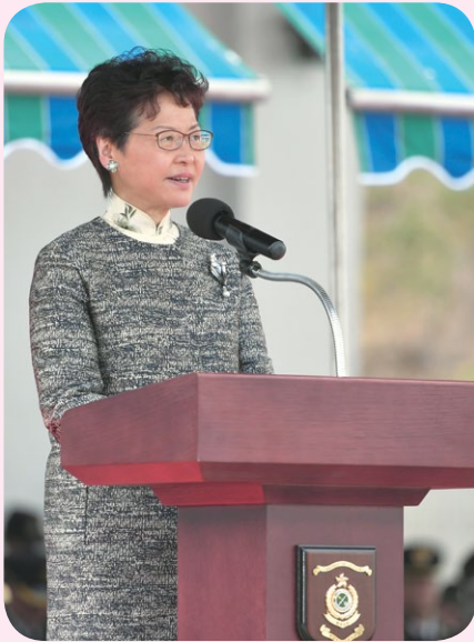
Chief Executive Mrs Carrie Lam delivers speech at the passing-out parade.

Graced by the inspection by Hong Kong Special Administrative Region (SAR) Chief Executive Mrs Carrie Lam, it is the Hong Kong Customs' honour to stage its passing-out parade for 183 well-trained Probationary Customs Officers at the Customs and Excise Training School (CETS) on April 13 this year.