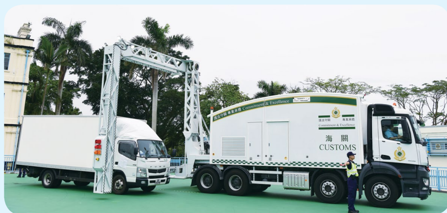
Officers of the Customs and Excise Department conduct an examination on a goods vehicle with the Mobile X-ray Vehicle Scanning System.

The third and final phase was a field operation exercise conducted at Lei