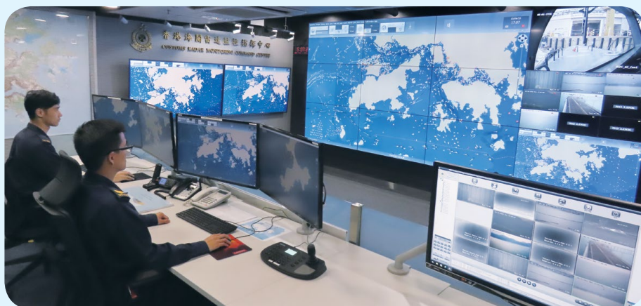
The Customs Radar Monitoring Command Centre at the Customs Marine Base.

Hong Kong Customs strives to step up its radar monitoring efficiency so that the highest degree of effectiveness in law enforcement at sea can be guaranteed. Thanks to the opening of the new Customs Radar Monitoring