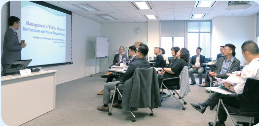
A course instructor shares experience with participants of the Eleventh Customs Management Development Course held from March 11 to April 3 this year.

The Eleventh Customs Management Development Course organised by the Office of Training and Development was held from March 11 to April 3 this