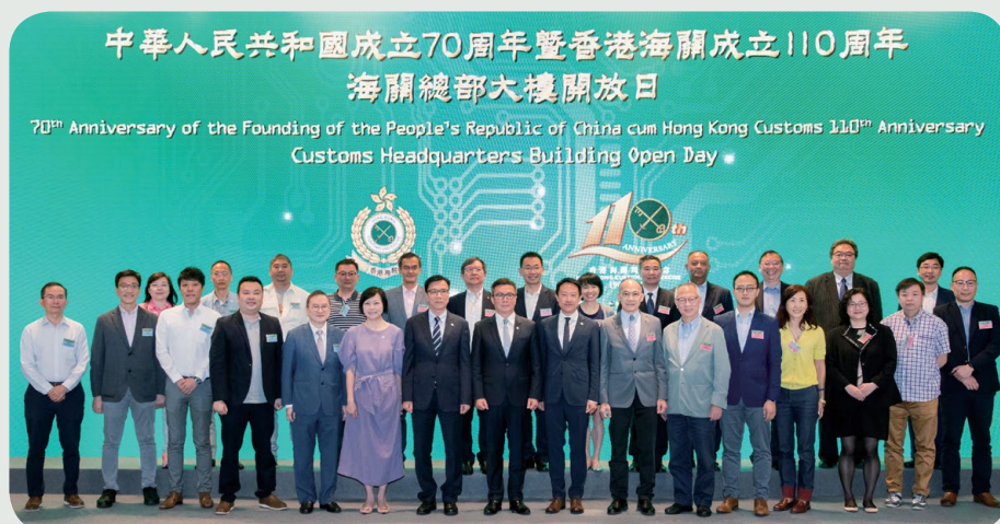
The Commissioner of Customs and Excise, Mr Hermes Tang (front row, eighth left), and fellow guests in a group photo at the Customs Headquarters Building Open Day.

the premier of the series of celebration events. Officiating at the opening ceremony, the Commissioner of Customs and Excise, Mr Hermes Tang, greeted about 100 representatives of the Department's working partners and introduced them to the different functions and duties of Hong Kong Customs. He said that, as the Outline Development Plan for the Guangdong-Hong Kong-Macao Greater Bay Area has been announced, apart from stepping up the current duties, Hong Kong Customs will also develop in accordance with the "smart customs" blueprint to help ensure the implementation of the "one country, two systems" principle. The five sessions held in June and July were well received by members of the public, with around 1 600 participants recorded. In order to help the participants to gain a better understanding of the development history, inheritance and law enforcement of Hong Kong Customs, guided tours were held to