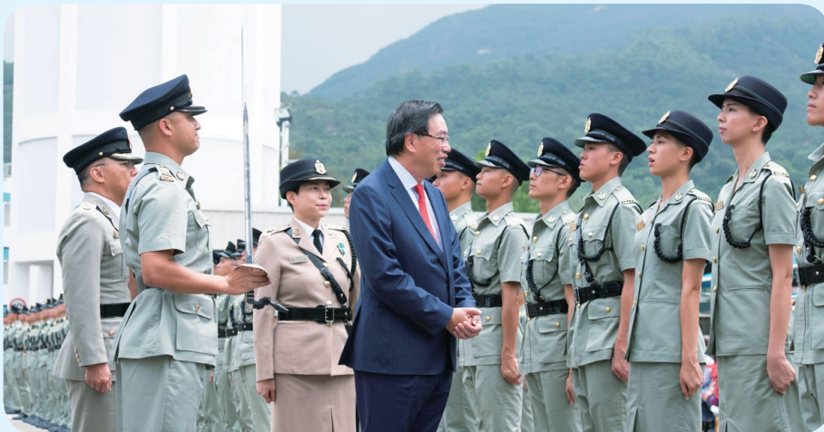
President of the Legislative Council Hon Andrew Leung inspects the Probationary Customs Officers at the passing-out parade.