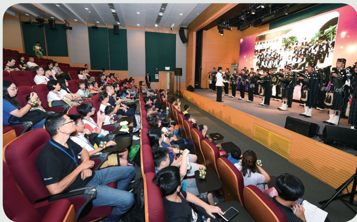
The Customs and Excise Band performs at the opening ceremony.