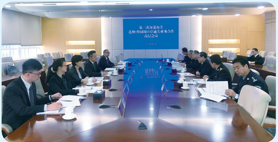
Both sides exchange views on co-operative measures for the Liantang / Heung Yuen Wai Boundary Control Point.

At the meeting, views on different customs issues and mutual-co-operation were exchanged. The discussion was good for strengthening