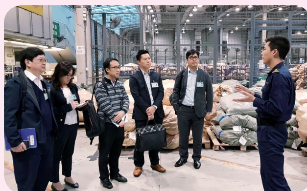
The Information Systems Strategy Study consultants visit the Air Mail Centre to get an understanding of the customs clearance of postal parcels.