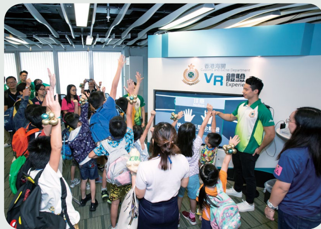
Attendees visit the exhibition gallery and the VR experience booth.