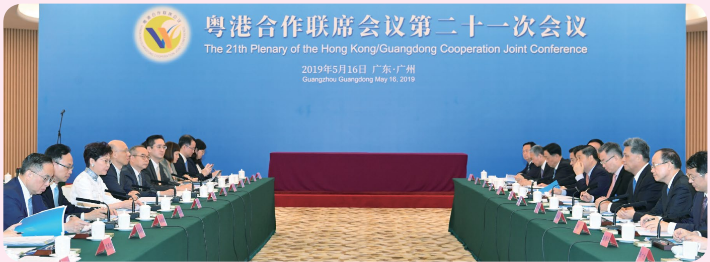
The Chief Executive, Mrs Carrie Lam, led a Hong Kong Special Administrative Region Government delegation to attend the 21st Plenary of the Hong Kong/Guangdong Co-operation Joint Conference in Guangzhou on May 16 this year, during which the Single E-lock Scheme's expansion to Zhongshan was confirmed, making the scheme to cover all the nine municipalities in Guangdong Province. Photo shows Mrs Lam (third left) and the Governor of Guangdong Province, Mr Ma Xingrui (third right), co-chairing the Plenary.

The Hong Kong Government and the Guangdong Provincial Government have never slowed their footstep in the development of the Guangdong-Hong Kong-Macao Greater Bay Area (Bay Area). Eight measures facilitating people to develop in the Greater Bay Area were announced after the second plenary meeting of the Leading Group for the Development of the Guangdong-Hong Kong-Macao Greater Bay Area held in March this year. One of the measures is the expansion of the implementation scope of the connection with the Speedy Customs Clearance (also known as the Single E-lock Scheme (SELS)) between Customs administrations. Later in May, the 21st Plenary of Hong Kong/Guangdong Co-operation Joint Conference held in Guangzhou confirmed the SELS's expansion to Zhongshan, making the scheme to cover all the nine municipalities in the Bay Area.