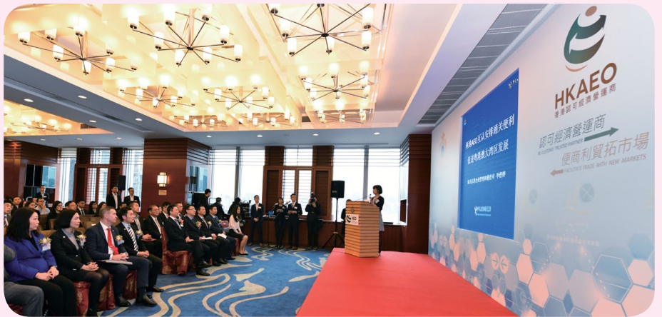
2019 HKAEO Certificate Presentation Ceremony cum Joint Promotion Seminar with GACC attracts more than 140 participants.