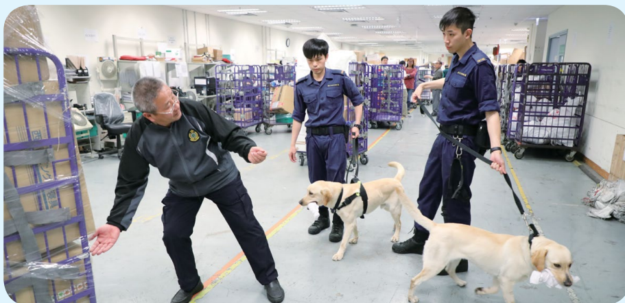
Dog instructor from the General Administration of Customs of China conducts parcel search training for Customs Detector Dog Team in Hong Kong.