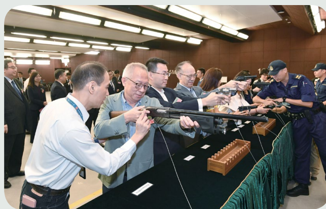
Hong Kong Customs held five open day sessions at the Customs Headquarters Building in June and July this year to launch a series of events in celebration of the 110th anniversary of the Department's establishment. Photo shows the attendees visiting the indoor firing range.