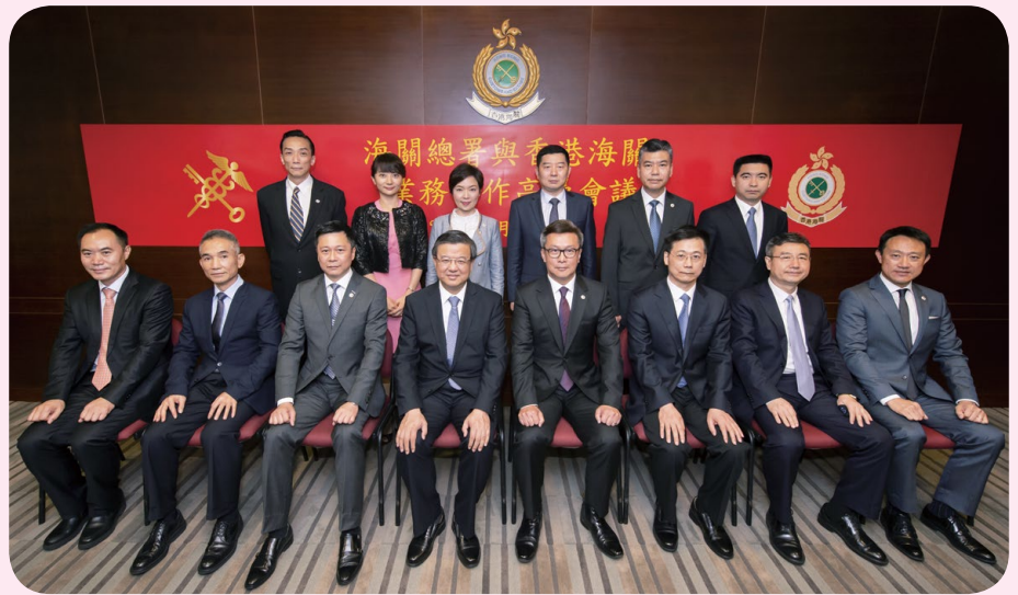
The Commissioner of Customs and Excise, Mr Hermes Tang (front row, fourth right), the Minister of GACC, Mr Ni Yuefeng (front row, fourth left), and members of both sides in a group photo.

The two customs administrations agreed to step up mutual-co-operation to make a more significant contribution to the economic development of both the Mainland and Hong Kong under the context of the development of the "Guangdong-Hong Kong-Macao Greater Bay Area". In this regard, the two sides specifically reached a consensus on a co-operative arrangement, under