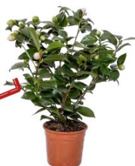
Potted Plants with peat/peat moss