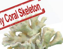
Stony Coral Skeleton