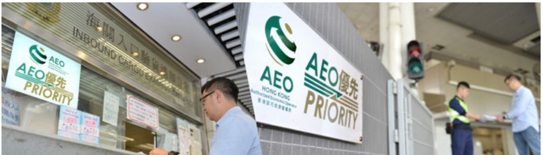
AEO 優先清關設施 AEO priority clearance facilities

Under the uncertain global trade environment, embracing predictability of the supply chain under the HKAEO Programme could be a measure to cope with the challenging environment. C&ED will continue to develop more MRAs with major trading partners to reinforce Hong Kong as a logistics hub and to aid HKAEOs in extending business network.