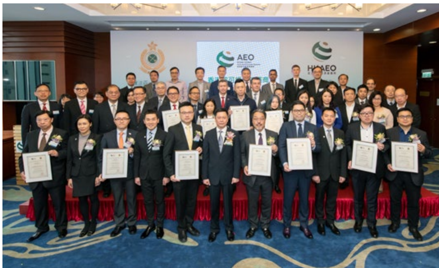
「香港認可經濟營運商」證書頒授典禮以表揚公司為香港海關可信賴的合作夥伴。 HKAEO Certificate Presentation Ceremony to award accredited enterprise as Customs' trusted partners.