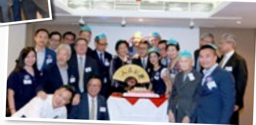
婦女委員會 - 25 周年慈善折子戲