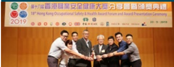
第十八屆香港職業安全健康大獎分享會暨頒獎典禮