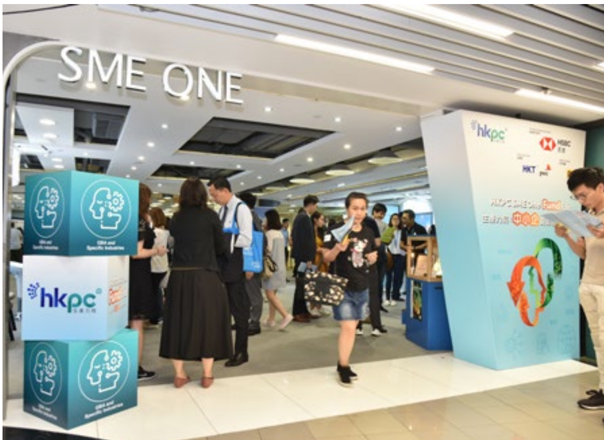
生產力局的「SME One 中小企一站通」與另外 3 間中小企服務中心，聯手推出一站式綜合服務。 SME One of HKPC also joined hands with other three SME support centres to provide integrated services.