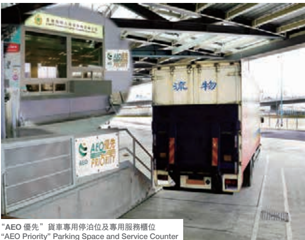
“AEO 優先”貨車專用停泊位及專用服務櫃位 “AEO Priority” Parking Space and Service Counter