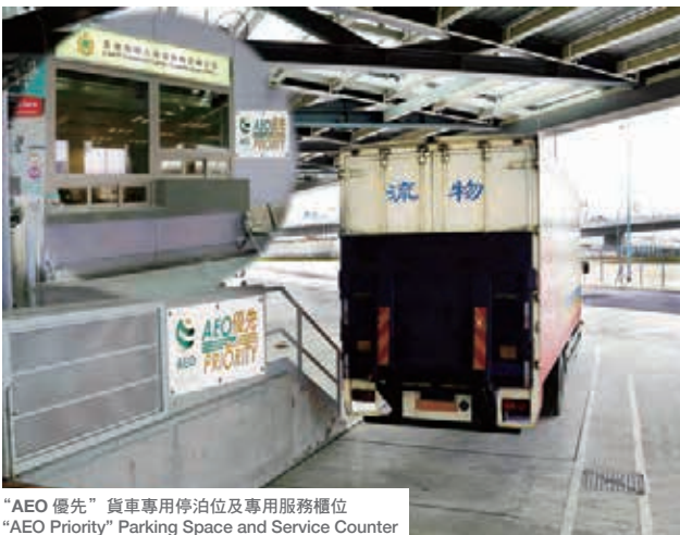
“AEO 優先”貨車專用停泊位及專用服務櫃位 “AEO Priority” Parking Space and Service Counter